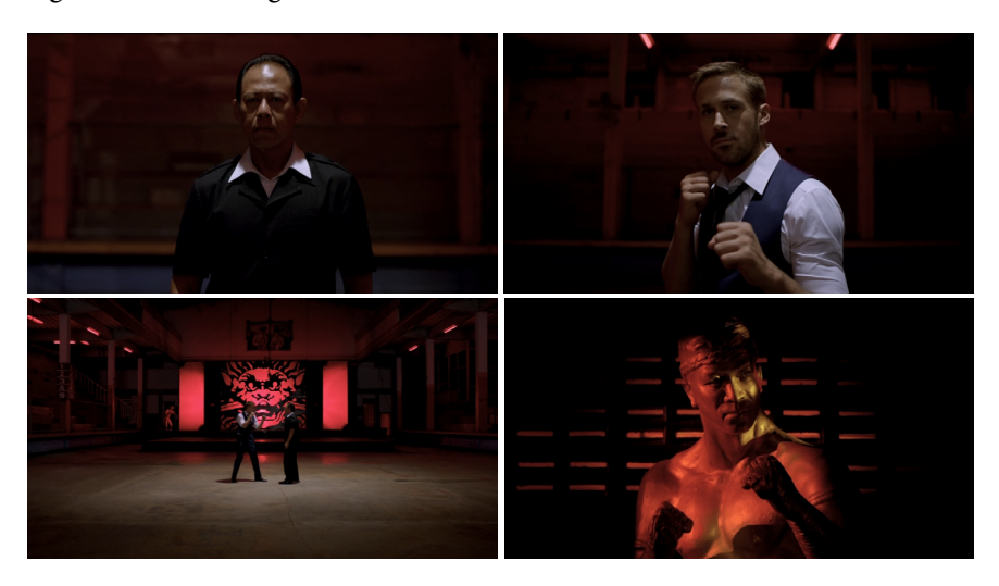
Fig. 4 – Frames from the 'Wanna Fight?' scene

giated synth, play with the listeners' perception of rhythm, from 3/4 to 6/8 meter at around minute three of the track. But what is more important is the scene's cinematography: red is the dominant color, mostly due to the neon lights and the oriental decoration in the background (figure 4, bottom left), while blue is featured as part of the protagonist's outfit and in those shots where the protagonist's mother approaches the room coming from a dark corridor, while the two men fight. There is an abundant use of slow motion and care for symmetry, while at times we can also see the statue of a man in a fighting pose (more likely a reference to vaporwave than synthwave) in a shady setting, only illuminated by suffuse red and vellow lights (figure 4, bottom right).