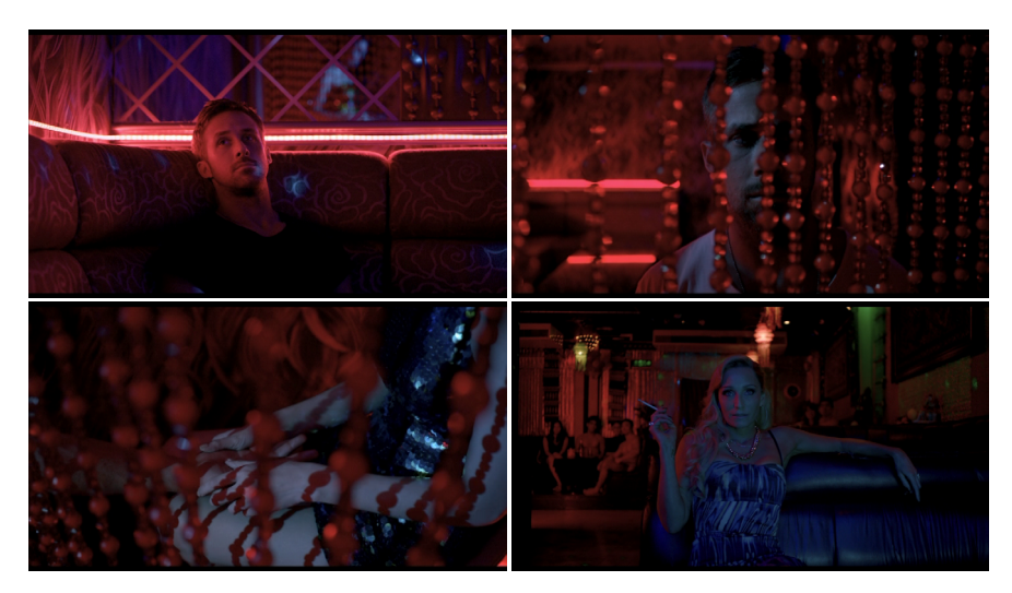
Fig. 5 – Frames from the bar scene

Thus, another second-order association takes shape. Refn is not interested in referencing the 1980s in his movies, nor is there an explicit or implicit connection with geek culture or filming technique from that decade—also given the fact that Refn's cinema tends to be much more highbrow-oriented compared to previous examples. What we can find in his films is the saturation and the aesthetic perfection of an idealized version of 1980s films (or perhaps their promotional material), hauntologically coming back from the world of the dead in its strongest incarnation. The postmodern city outlook, neon lights, the promise of a wealthy future... all worn inside out, playing in reverse, and brought to its extreme consequences, but still there: more 1980s than the 1980s.<sup>54</sup>