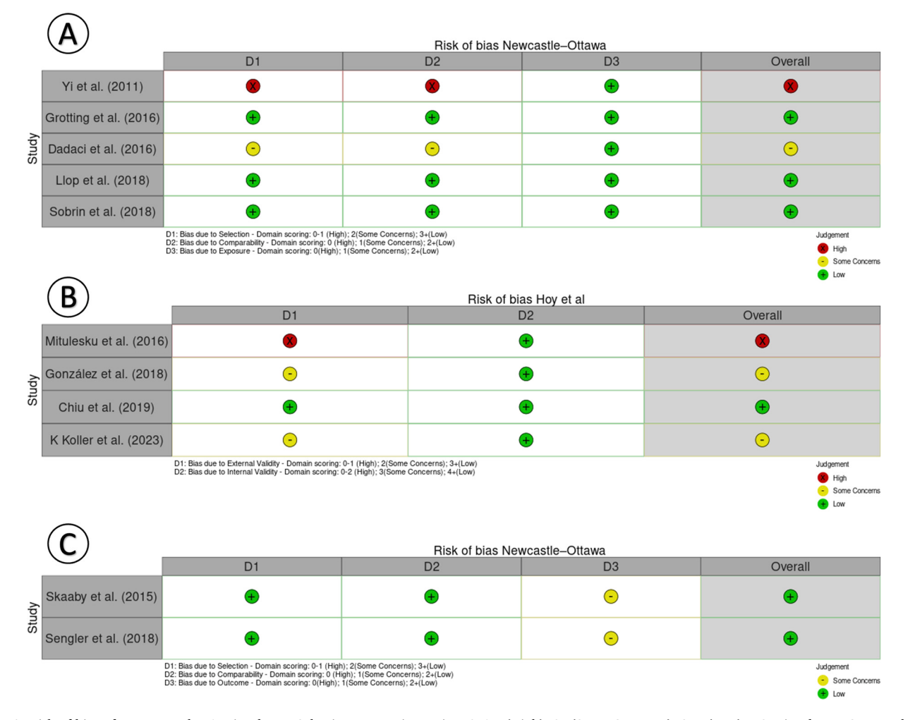
Fig. 3. A. Risk of bias of case-control: D1: Bias due to Selection – Domain scoring: 0-1+ (High); 2+(Some Concerns); 3 + (Low); D2: Bias due to Comparability – Domain scoring: 0 (High); 1+(Some Concerns); 2 + (Low); D3: Bias due to Exposure – Domain scoring: 0+(High); 1+(Some Concerns); 2 + (Low) B. Risk of bias of Cross-Sectional: D1: Bias due to External Validity – Domain scoring: 0-1+ (High); 2+(Some Concerns); 3 + (Low); D2: Bias due to Internal Validity – Domain scoring: 0-2 + (High); 3 +(Some Concerns); 4 + (Low) C. Risk of bias of cohorts: D1: Bias due to Selection – Domain scoring: 0-1 + (High); 2 +(Some Concerns); 3 + (Low); D2: Bias due to Concerns); 3 + (Low); D2: Bias due to Concerns); 3 + (Low); D2: Bias due to Concerns); 3 + (Low); D2: Bias due to Concerns); 4 + (Low) C. Risk of bias of cohorts: D1: Bias due to Selection – Domain scoring: 0-1 + (High); 2 +(Some Concerns); 3 + (Low); D2: Bias due to Concerns); 3 + (Low); D2: Bias due to Concerns); 3 + (Low); D2: Bias due to Concerns); 4 + (Low) C. Risk of bias of cohorts: D1: Bias due to Selection – Domain scoring: 0-1 + (High); 2 +(Some Concerns); 3 + (Low); D2: Bias due to Concerns); 3 + (Low); D2: Bias due to Concerns); 4 + (Low) C. Risk of bias of cohorts: D1: Bias due to Selection – Domain scoring: 0-1 + (High); 1 +(Some Concerns); 2 + (Low); D3: Bias due to Outcome – Domain scoring: 0(High); 1+(Some Concerns); 2 + (Low).