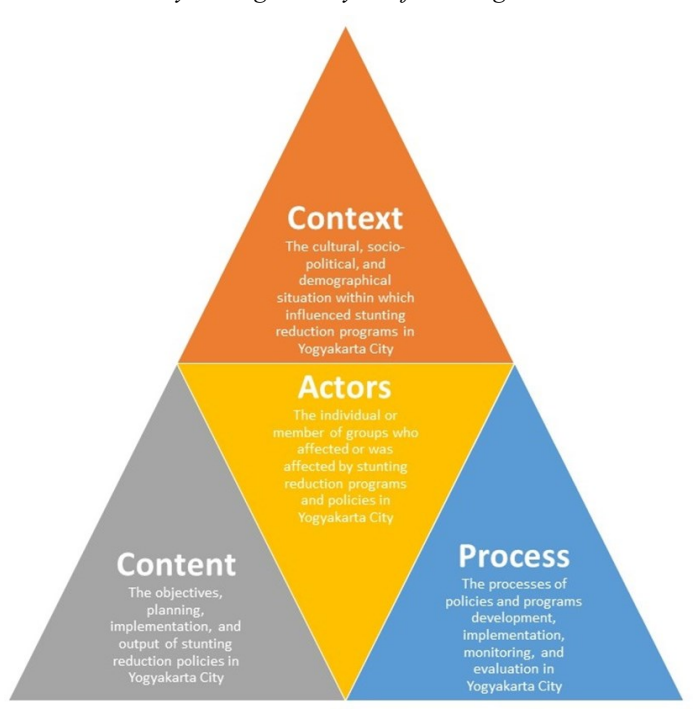
Figure 1. Policy triangle framework (adapted from Walt & Gilson, 1994)

However, this prevalence has remained constant, without any significant reduction, with figures of 10.2% (2016), 11.1% (2017), 10.5% (2018), and 9.7% (2019) (Department of Health of Yogyakarta City, 2021). These consistent figures may indicate underlying issues that current nutrition-related programs have been unable to address. Reducing the prevalence of stunting in Yogyakarta City is crucial to upholding the rights of the child and diminishing the overall stunting prevalence in Yogyakarta Province, which stood at 16.4% in 2022 (Ministry of Health of Indonesia, 2022).