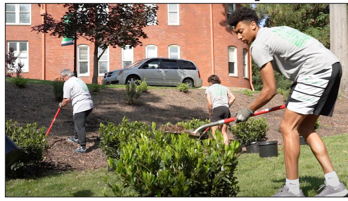
Volunteers garden for Community Cares Week