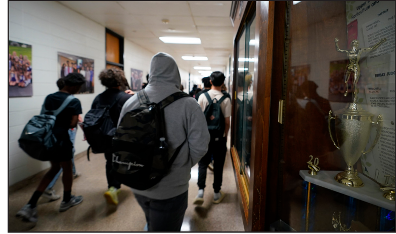
Students walk through Upper Darby High School.

experiences by offering students individualized support and breaking down complex problems into smaller challenges or tasks.