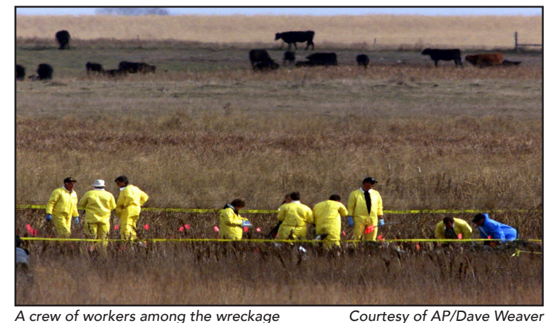
A crew of workers among the wreckage

On Monday, it took investigators several hours to hike into the rural area where the plane crashed about 60 miles (97 kilometers) southwest of