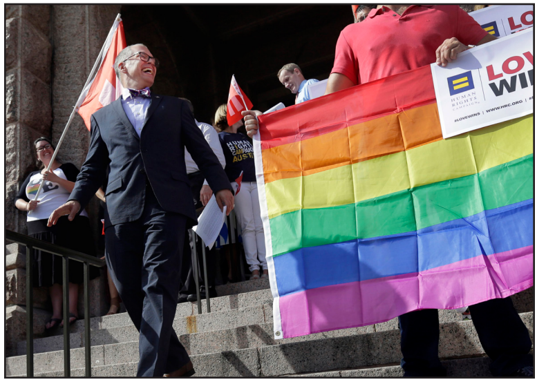
Jim Obergefell, the named plaintiff in the Obergefell v. Hodges Supreme Court case that legalized same sex marriage.