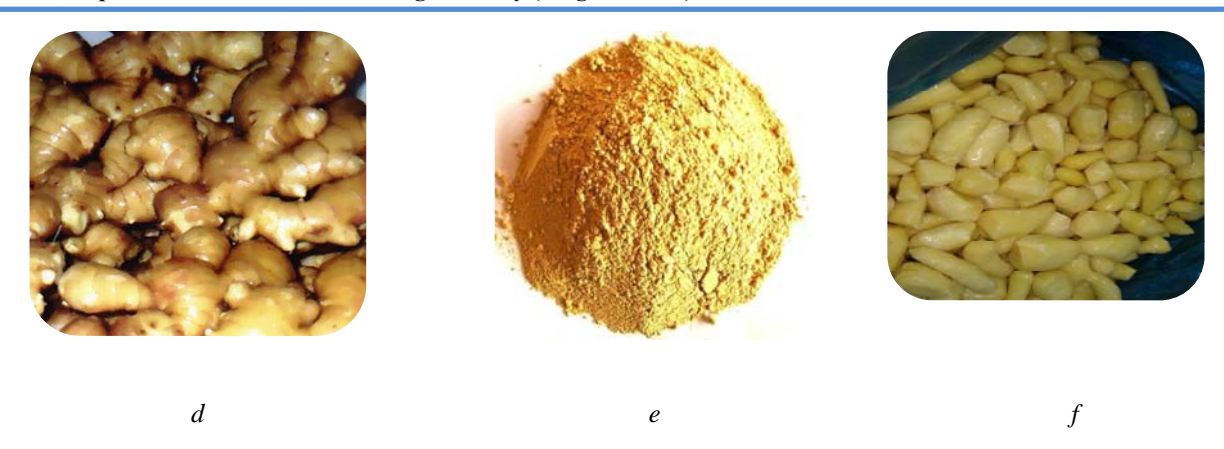
Figure 1. Some images of the G10 ginger variety

a, b: The G10 ginger variety planted in Bac Kan province; c. The G10 ginger variety planted in Hoa Binh province; d. G10 fresh rhizomes; e. Ginger powder; f. Ginger powder products.