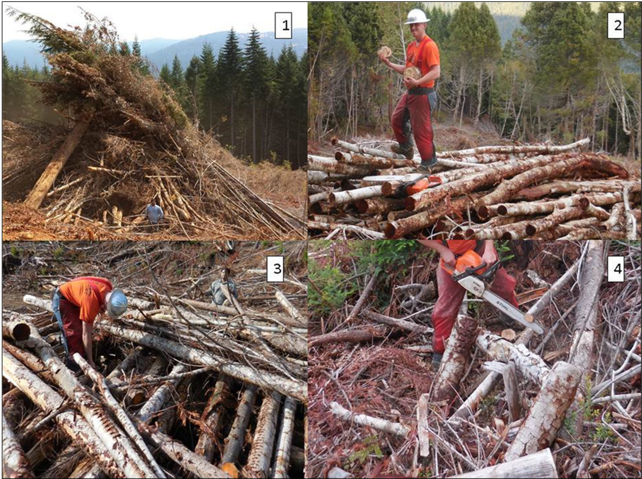
Figure 2. The forest residue arrangement patterns. 1. Teepees; 2. Processor piles; 3. Criss-cross piles; and 4. Scattered.

event. The plastic cover used was “all-weather polyethylene” sheets with an area of 6 \times 30 m (weighed 26 kg). All arrangement patterns were replicated at least once (except for covered piles) in all the three units.