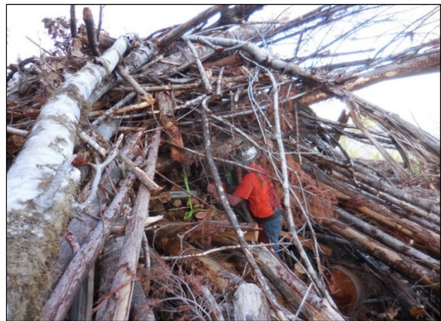
Figure 3. Wood disc being sampled from conventional teepees using transect sampling procedure.

the complete diameter to extract the wood discs (Gautam et al., 2012). The remaining materials that were not sampled were left undisturbed for future sampling. This approach ensured that continuous sampling was possible in natural in-field conditions, while considering various geometries of the sample piles (fig. 3) (Kizha and Han, 2017). Since it was not physically possible to collect a sample from the middle of