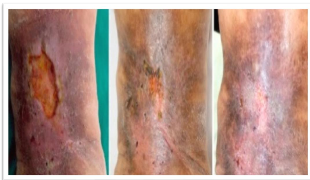
Figure 2. Example of wound healed completely (left, week 0; middle, week 7; right, week 12).

Assessing the extent of healing, 34.8% of wounds healed completely (Figure 2), no further treatment being required, while 21.7% showed partial healing (Figure 3), defined as a 50% reduction in wound size. Therefore, we could consider that the treatment was successful in 56.5% of wounds, that is, all the cases in which some level of healing was observed. Among the other wounds, infections developed in 34.8% of cases.