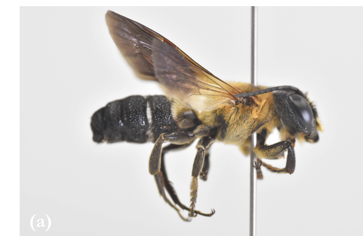
Fig 2. a.) Giant Resin Bee ( Megachile sculpturalis )