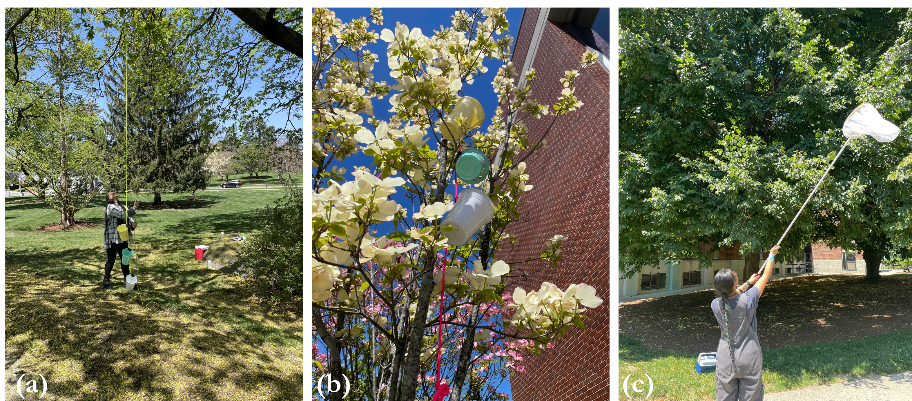
Fig. 1 a.) Bee cups being set up in a Norway maple ( Acer platanoides ). b.) Bee cups located in the canopy (upper) of a kousa dogwood ( Cornus kousa ). c.) Sweep netting being done in a littleleaf linden ( Tilia cordata ).