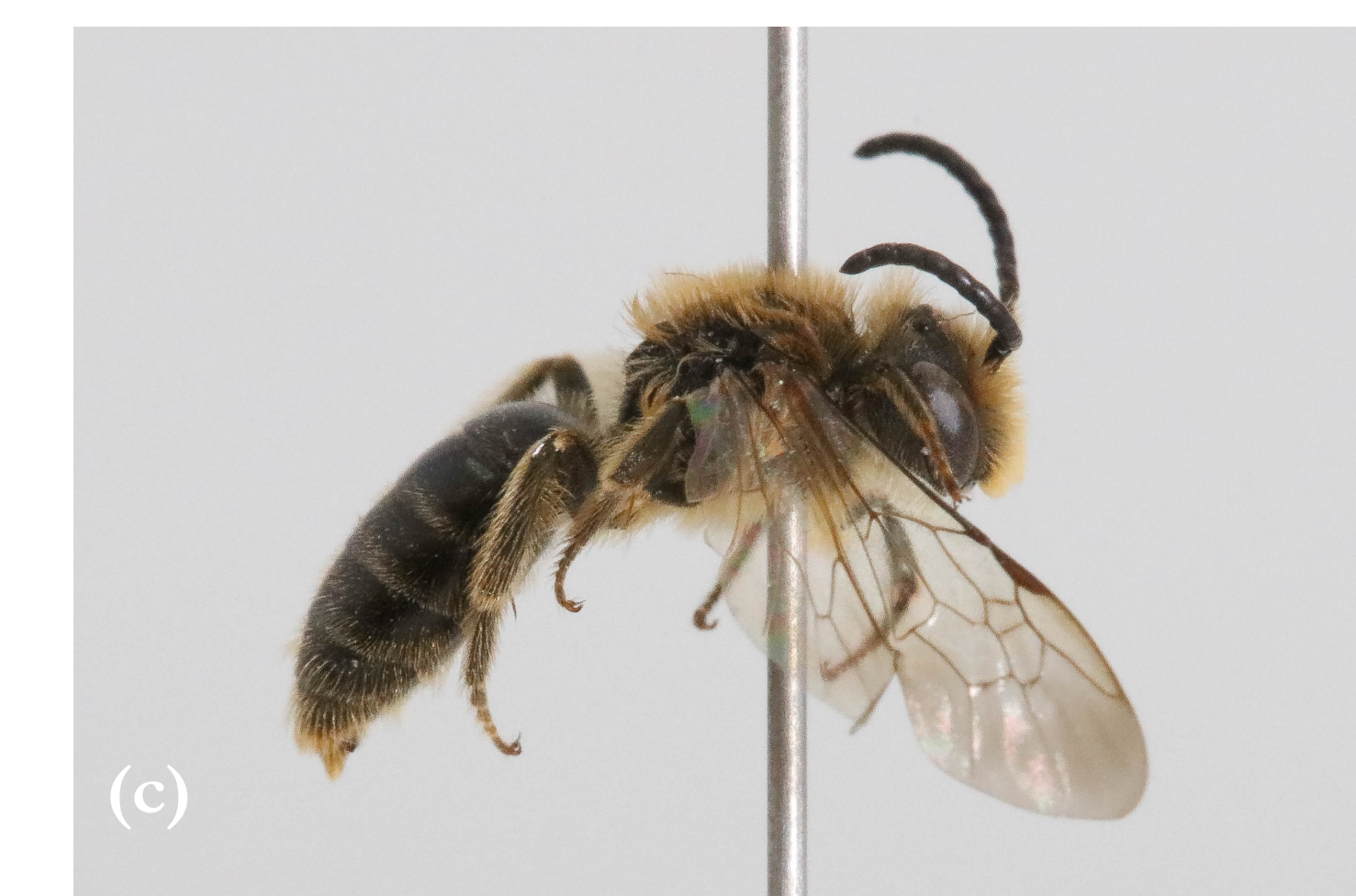
c.) Cherry Mining Bee ( Andrena pruni )