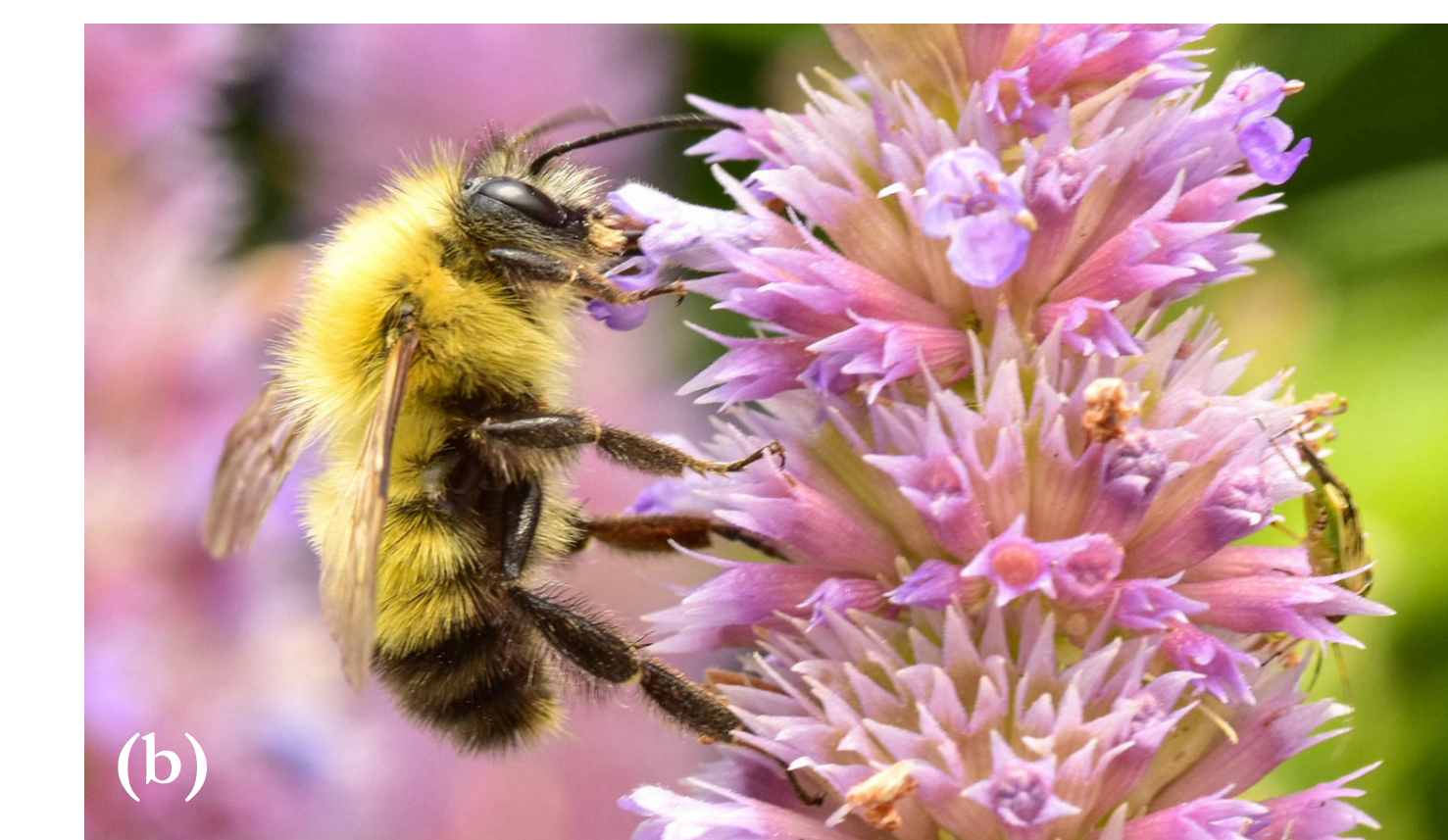
b.) Confusing bumble bee ( Bombus perplexus ) on anise hyssop