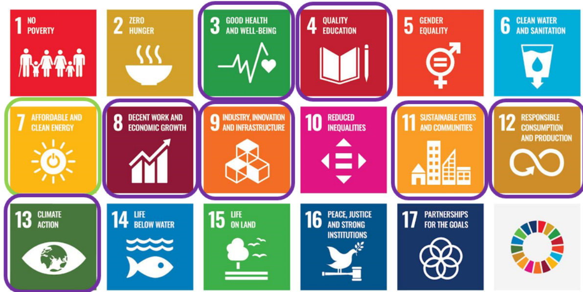
Fig. 4. SDGs related to achieving SDG#7 for the Netherlands

We do see a link to good health and well-being (SDG#3) and climate action (SDG#13) through the climate act goals and policy links to the delta plan for spatial adaptation. We also see a strong link to decent work and economic growth (SDG#8) as the existing gas infrastructure is scheduled to be abandoned and replaced with mainly renewable technologies.