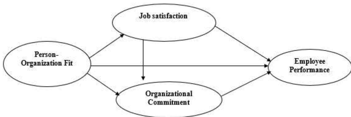
Figure 1. Conceptual Framework

The description of the conceptual framework is implemented to show the patterns by which each independent variable influences the dependent determinant, as shown in Figure 1.