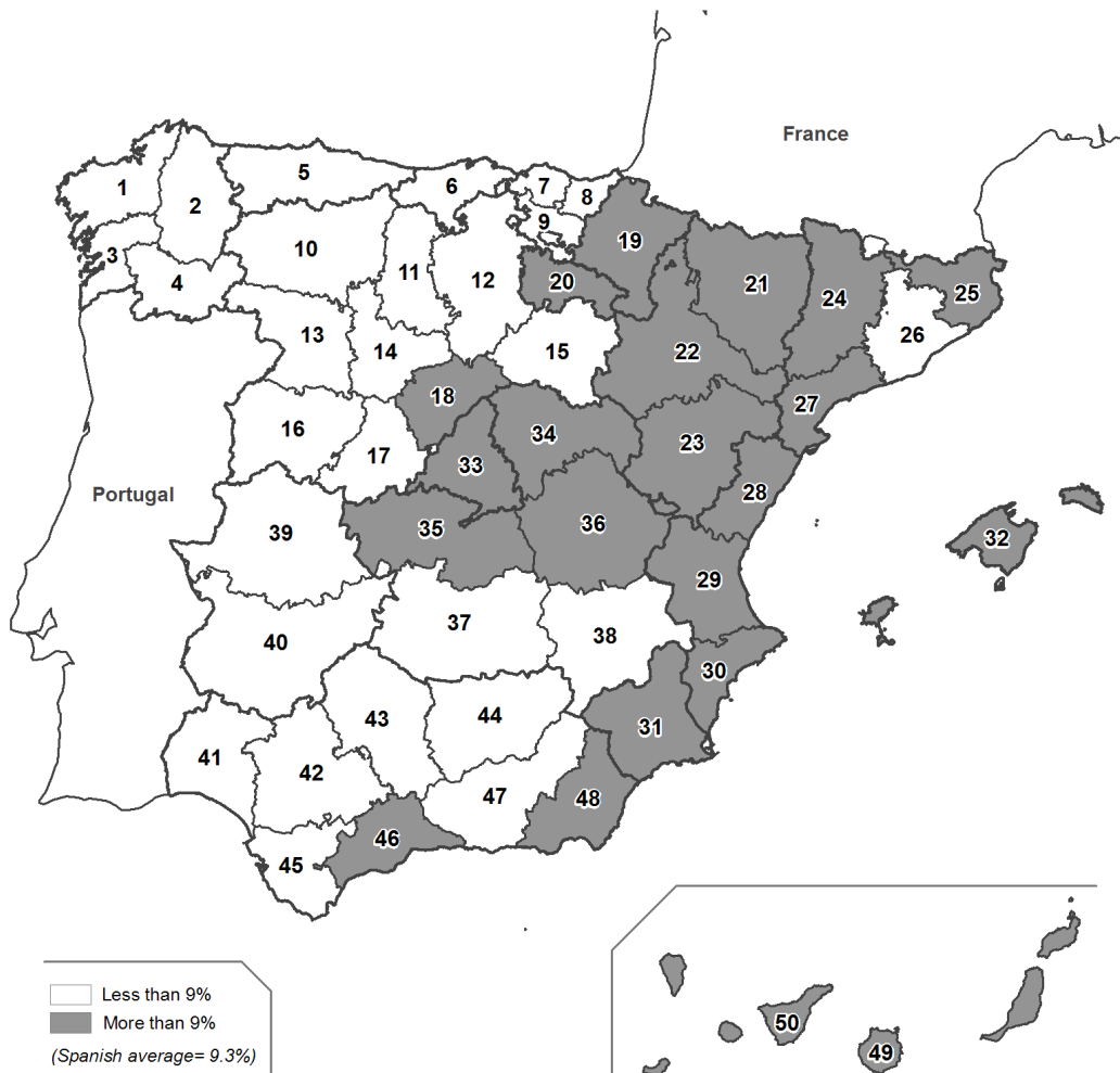
Figure 1. Stock of foreign-born population in rural areas in 2008. Spanish provinces

Source: 2008 Spanish Register of Inhabitants.