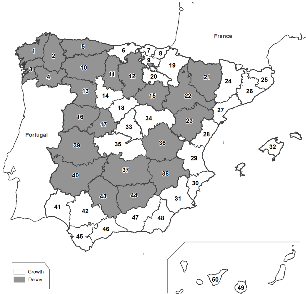
Figure 2. Rural population change in Spain between 1991 and 2008