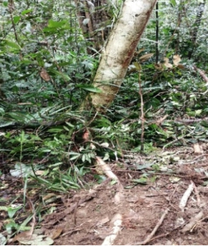
Figure 4 Skidding activity in the logging area and tilted damage on the residual stand due to timber skidding.

skid trail direction should be traceable on the felled tree map to avoid high damage. The skidder operators need to provide a tree map to facilitate the felled tree tracking. A tree map contains the location and identity of the tree being felled.