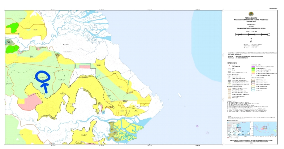
Figure 1 Location of study site in PT Inhutani I Sambarata Unit, Berau District, East Kalimantan.

Skid trails are roads that connect one tree to a landing point. The skidding trails were constructed to connect one tree fell. The construction of skid trails was carried out simultaneously with the extraction of logs after the trees fell.