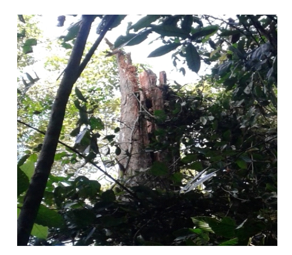
Figure 3 Residual stands damaged due to felling.

The average residual stand damage with the improved technique was lower (9.89%) compared to conventional techniques (14.92%). There, it can minimize the residual stand damage by 33.71% since applying the improved technique. The improved technique is a timber harvesting technique that follows the proper and correct RIL principles, such as how to make under the cut, backcuts, the felling direction of trees, etc. Elias et al. (2001) stated that the best procedure for determining the felling direction was to approach or avoid the skid trail by forming an angle of 30-45 (fish fin pattern) or the felling direction in a parallel position on the skid trail with the opposite direction to the skid trail if allows the felling directed to a clear area and to the canopy of the tree that was previously felled (maximum of 3) and on steep areas the felling direction was oblique to the side of the slope (along the contour). The residual stand damage caused by felling could be avoided and minimized so that stand growth for the following year and product quality could increase (Bodaghi et al., 2020).