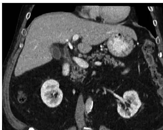
Figure 4. Complete resolution of the hepatic abscess. CT of the abdomen revealing complete resolution of the hepatic abscess.