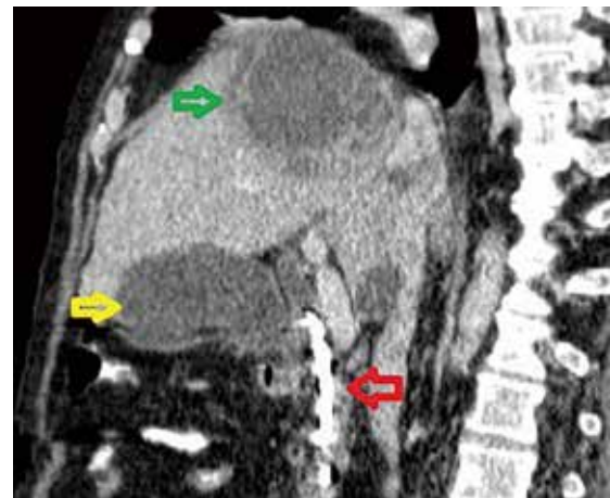
Figure 2. Hepatic abscess, stent in CBD and gallbladder. CT of the abdomen depicting the hepatic abscess, the stent in CBD and the gallbladder. The green arrow is demonstrating the hepatic abscess, the red arrow is depicting the stent in CBD and the yellow arrow is showing the gallbladder.

of the specimen was negative for malignancy, whereas the cultures revealed the growth of Enterococcus faecalis and Klebsiella pneumoniae . The initial empiric antibiotic therapy with ceftriaxone, metronidazole and gentamicin was modified according to pus cultures to ciprofloxacin and linezolid. The clinical condition of the patient was improved and an abdominal CT was performed 8 days after his admission to the hospital revealing significant decrease in the dimensions of the liver abscess (Figure 3). Nevertheless, a second pigtail stent was inserted (Figure 3). The patient received intravenously 0.8 gr Ciprofloxacin/day for 22 days and 1.2 gr Linezolid/day for 22 days. He also received 1 gr Ciprofloxacin/day and 1.2 gr Linezolid/day per os, for 30 days after his discharge.