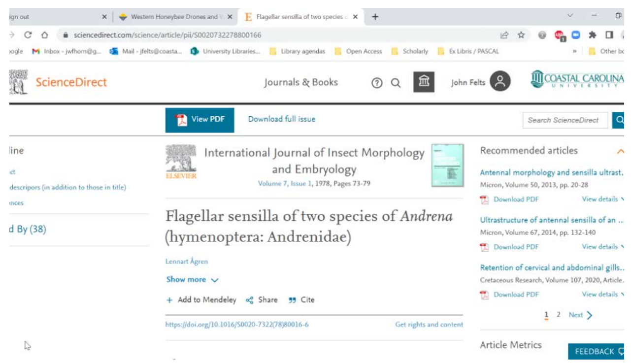
Fig. 5. SeamlessAccess persistence service (from ACS to ScienceDirect).

When leaving a vendor's website to view information behind a paywall on a different vendor's site, there is no longer the need to go through the cumbersome authentication process yet again since the SeamlessAccess persistence service has stored this information in the user's local browser storage. Figures 6 and 7 shows that the user simply clicks on the SeamlessAccess button, which transparently sends them through their local authentication to verify that they are allowed access to this resource before redirecting them to vendor's platform.