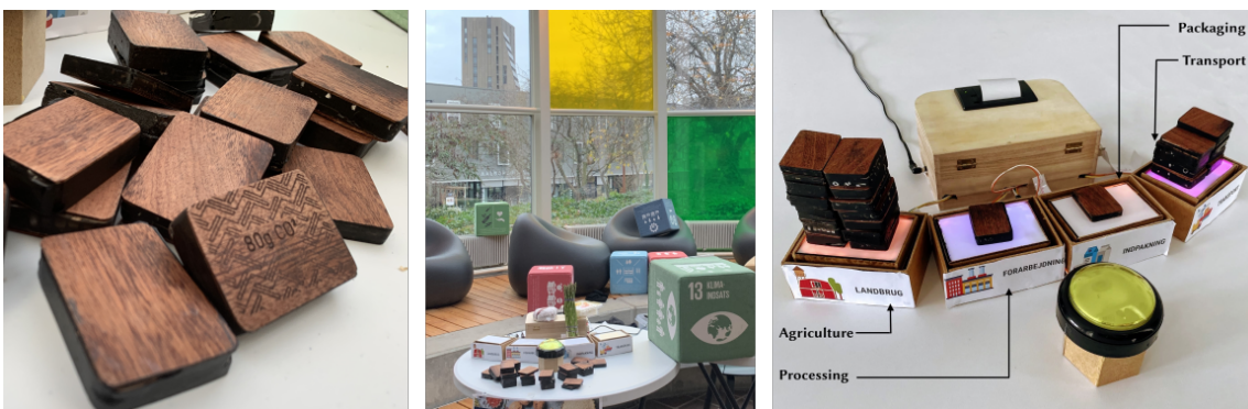
Figure 3.4: Technology probe, Carbon Scales, consisting of physical blocks (Carbon Bits) and four platforms that can be used to weigh carbon emissions from food production.

Probing into possible future scenarios gives an opportunity to reflect on these futures in the context of the present. In addition, probes are great at challenging what we know, as shown in the work with Carbon Scales [89], a data physicalisation for sense-making about CO 2 emissions in food production (see Figure 3.4). Carbon Scales invited people to make sense of CO 2 emissions from food production by physically moving Carbon Bits. This process tapped into the assumptions people have about where their food comes from and how it is produced. So, although the work with Carbon Scales did not result in a more elaborate prototype, it helped answer questions about what we do and do not know about the globalised food system. Hence, it acted as a probe for conversations about the food system at large and the changes that need to happen. The probing techniques facilitated a form of futurescaping [9] by establishing future scenarios where data-enabled decision-making and sense-making for sustainable consumption are possible.