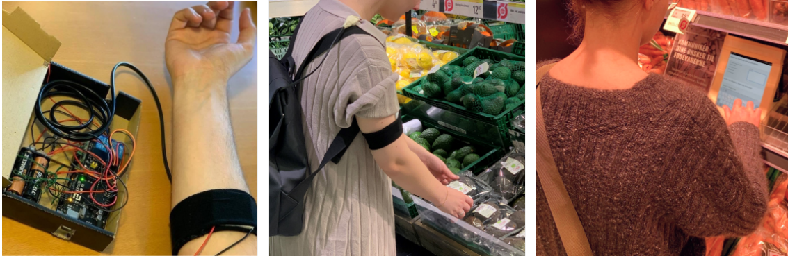
Figure 3.3: Technology probes, Sensing Climate Change and Connecting Stakeholders, consisting of a sleeve that regulates body temperature and a web application for tablet devices that allows communication with stakeholders in food stores.

text of sustainable consumption where social settings are often imaginative and, therefore, difficult to experience firsthand [9].