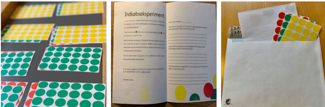
Figure 3.1: Cultural probe consisting of stickers and reflection sheet for evaluating food sustainability.

with the EnergyFetcher [90] and Sensing Climate Change [88] probes. In the EnergyFetcher study, the research question was how preference for specific food products could change values from altruistic to egoistic during food shopping [90]. The EnergyFetcher probe pack involved a technology probe, EnergyFetcher, and a digital survey in the form of a chatbot that prompted participants to reflect on their food shopping on a regular basis (see figure 3.2). In addition, the Sensing Climate Change study had the purpose of investigating how embodied interactions with data alter people's stance towards the environment. This was investigated by deploying a technology probe that invited sensing climate change based on slow adjustments to body temperature (see figure 3.3). Therefore, the two studies provided insights for Research question 2 about how people use data to make sense of sustainable consumption and Research question 3 about how to foster sense-making and engagement in sustainable consumption through design.