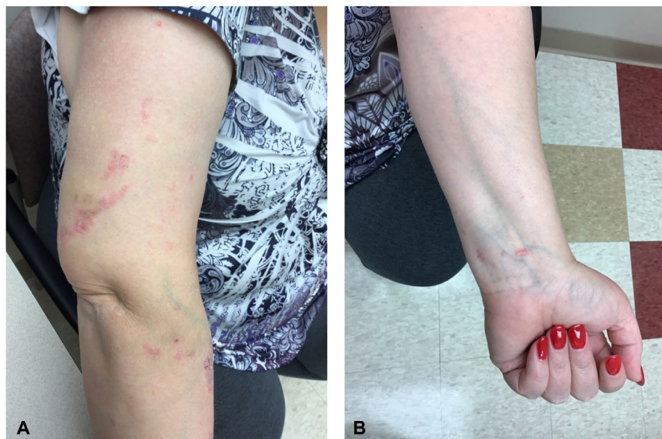
Fig 1. Lichen planus eruption 4 months after allergic contact dermatitis and 2 months after discontinuing guselkumab. Clinical examination shows scaly papules and plaques across the lateral aspect of the right upper arm (A) and the palmar aspect of the left wrist (B).