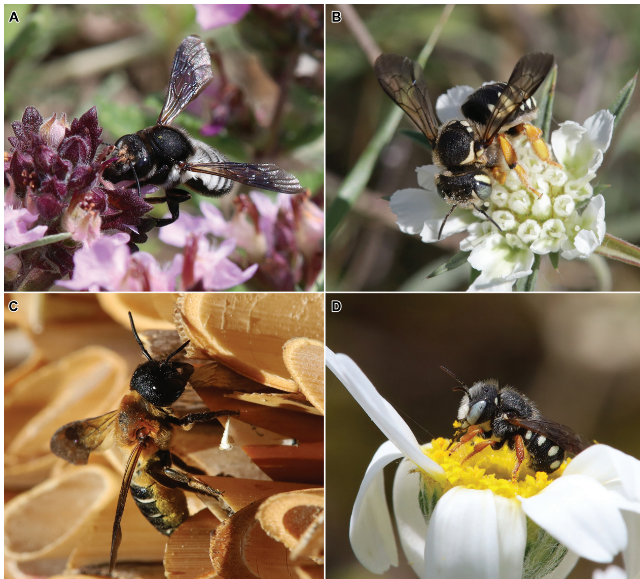
Figure 2. Some species of bees recently reported from Russia A female of Megachile albocristata Smith, 1853 at flower of Teucrium chamaedrys L. (Lamiaceae), Dagestan Republic, 13.VI.2021 B female of Trachusa integra (Eversmann, 1852) on inflorescence of Lomelosia argentea (L.) Greuter & Burdet (Caprifoliaceae), Crimea, 10.VII.2023 C female of Megachile sculpturalis Smith, 1853 at her nest, Crimea, 24.VII.2021 D male of Pseudoanthidium stigmaticorne (Dours, 1873) on inflorescence of Anthemis ruthenica M. Bieb. (Asteraceae), Crimea, 5.VI.2021.