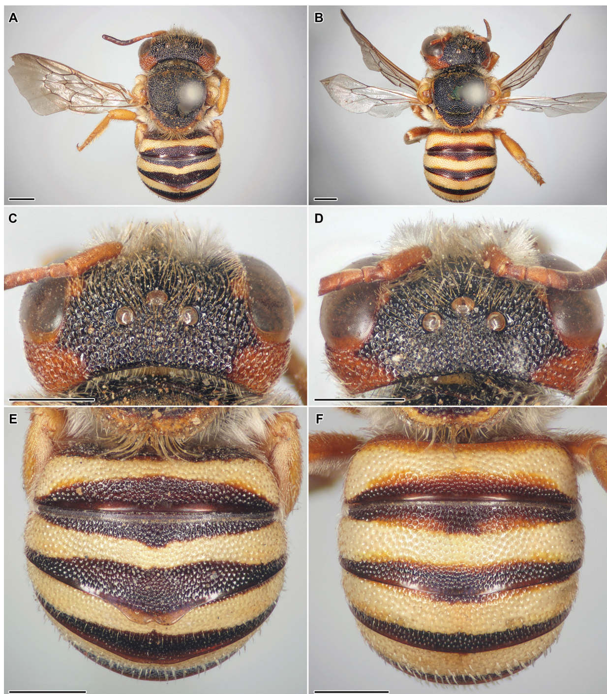
Figure 1. Icterantheidium floripetum (Eversmann, 1852) A, C, E lectotype, female B, D, F paralectotype, male A, B habitus in dorsal view C, D head in dorsal view E, F metasoma in dorsal view. Scale bars: 1 mm.