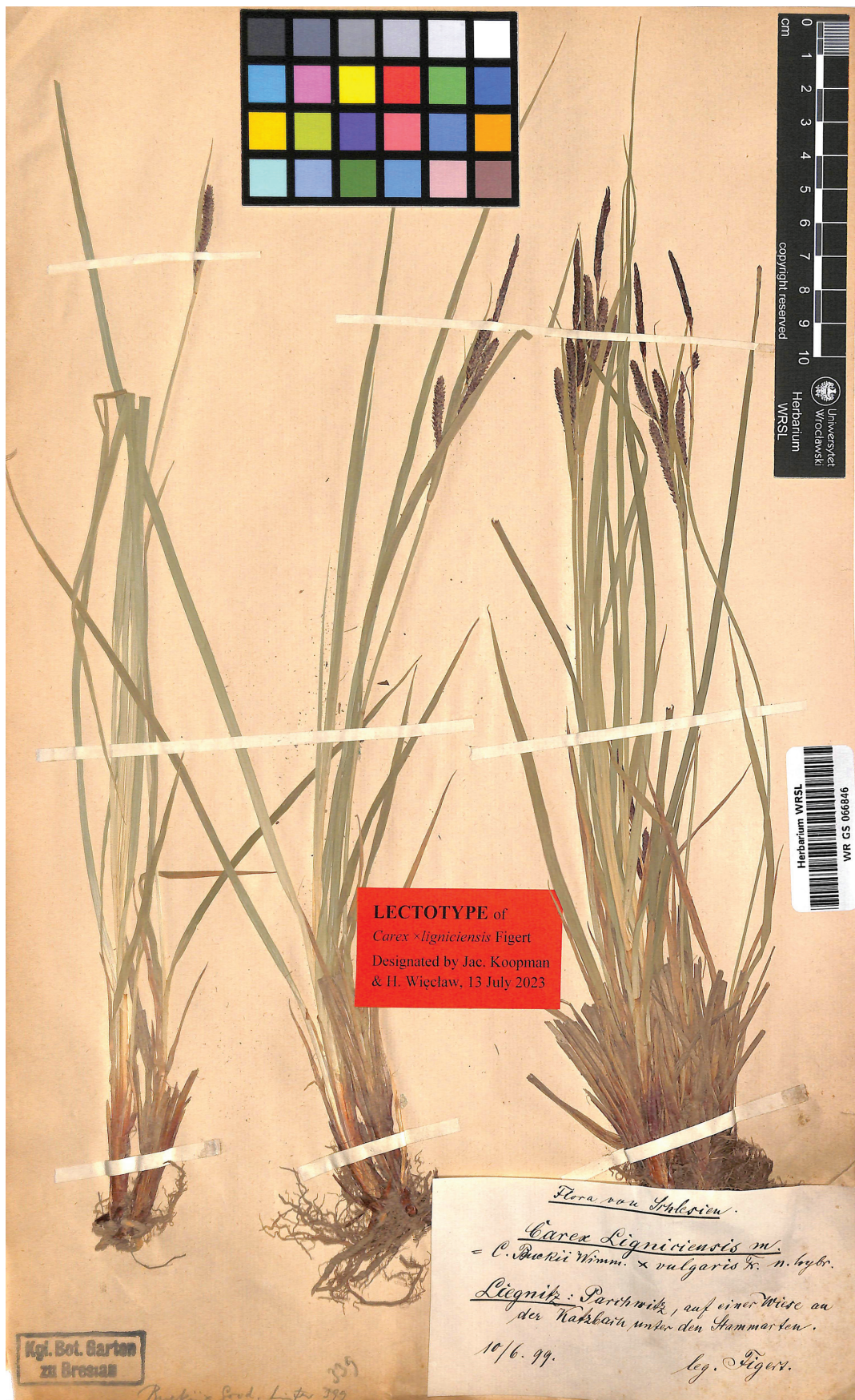
Figure 1. The lectotype of Carex x ligniciensis Figert (WRS� barcode WR GS 066846).