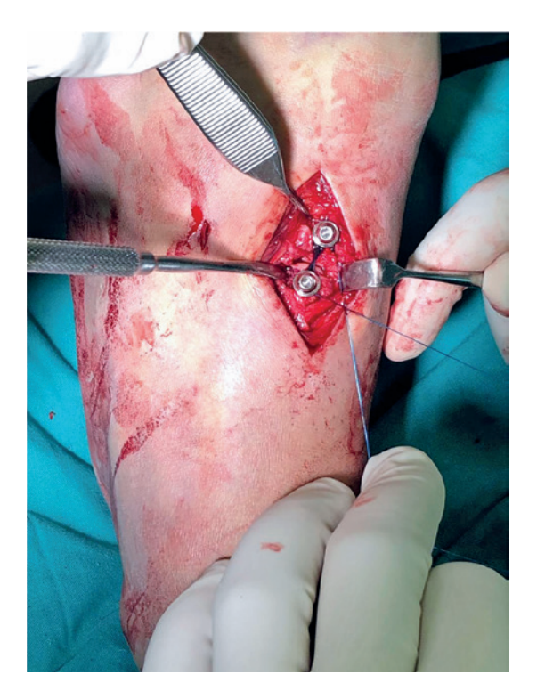
Figure 2. Flexible Fixation of the first TMT in situ . Two screws are placed in the metatarsal and in the respective cuneiform. A non-absorbable suture is wrapped in a figure-of-eight fashion and tied.

Elective, unplanned removal of hardware (ROH) was performed in 4/16 (25%) of the overall cohort, and only in 3/9 (33.3%) of patients who underwent ORIF. On average, ROH was performed 7.9 months after index procedure. Irritation from the FF hardware or suture knot, specifically, was not an indication for hardware removal in any case, with predominant complaint being "stiffness".