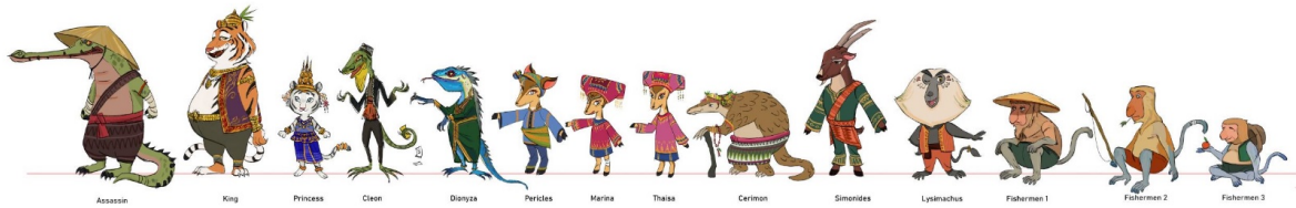
Figure 4. Full character lineup for Pericles VR.

Audiences are not required to believe that the events unfolding must operate within a contemporary or fictional reality and are instead prompted to adopt something resembling Brecht's 'alienation' or 'distancing' effect – that is, rather than simply subconsciously identifying themselves with the characters in the play, consciously accepting or rejecting the actions and themes they observe within the virtual environment.