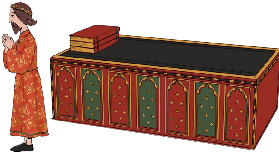
Figure 4. Character design for John Gower and the tomb from which he rises in the game’s introductory sequence. Both assets are firmly rooted in historical reality, closely resembling the poet’s tomb and effigy in London’s Southwark Cathedral.

This approach can also be drawn out from Shakespeare’s original language.