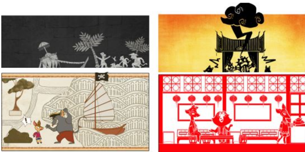
Figure 1. Frames from 2D cut scenes, with stylistic approach drawing on Southeast Asian traditions of map making, relief carving, papercutting, and shadow puppets.

While in a video game adaptation of Macbeth , a lack of narration and text can be justified as "people who already know Shakespeare's text well can envision the text behind the game's design with minimal assistance" (Hunter 8), this is less likely to be the case for the students engaging with our game, who are unlikely to have previously encountered Pericles .