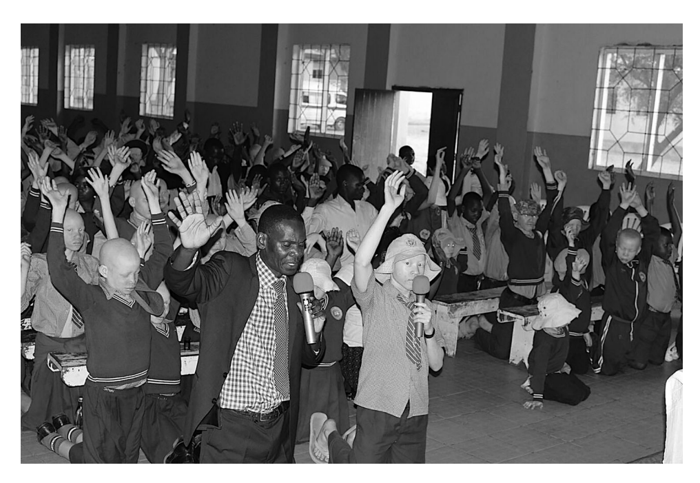
FIGURE 4 At a Pentecostal church outside of Mwanza, a pastor and student with albinism preach the gospel. In Tanzania, albinism activism has been heralded by Pentecostals as a means of transforming how others understand the nature of unseen realms. Mwanza, June 2015.