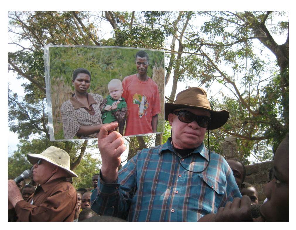
FIGURE 1 At an Understanding Albinism seminar, an albinism rights activist holds a picture of two Black parents with their child with albinism. The poster is designed to teach seminar participants that albinism is a recessively inherited genetic condition. Ukerewe Island, Mwanza, August 2015. [This figure appears in color in the online issue]