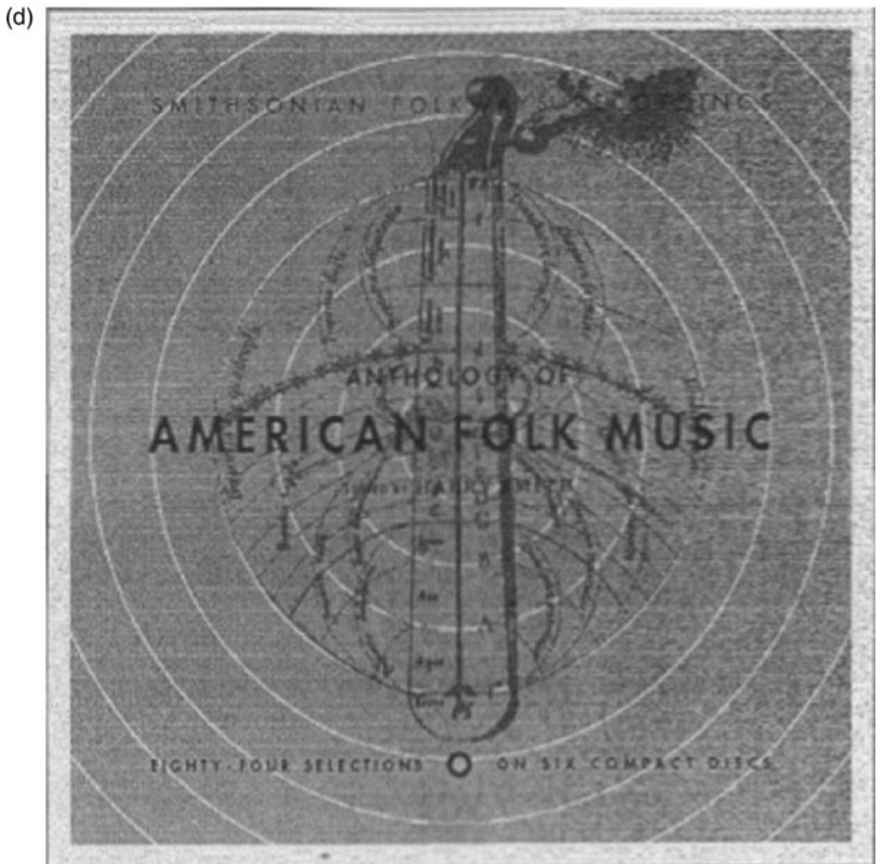
Figure 3. Continued.