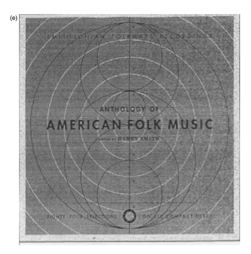
Figure 3. Continued.

This preference for Smith's original vision, elevated to a museum piece, was evident nowhere more clearly than the booklet. The original booklet was perhaps the hallmark of the Anthology , totally unlike anything else. As the producers take pains to note, its inclusion in the reissue was a precise facsimile: