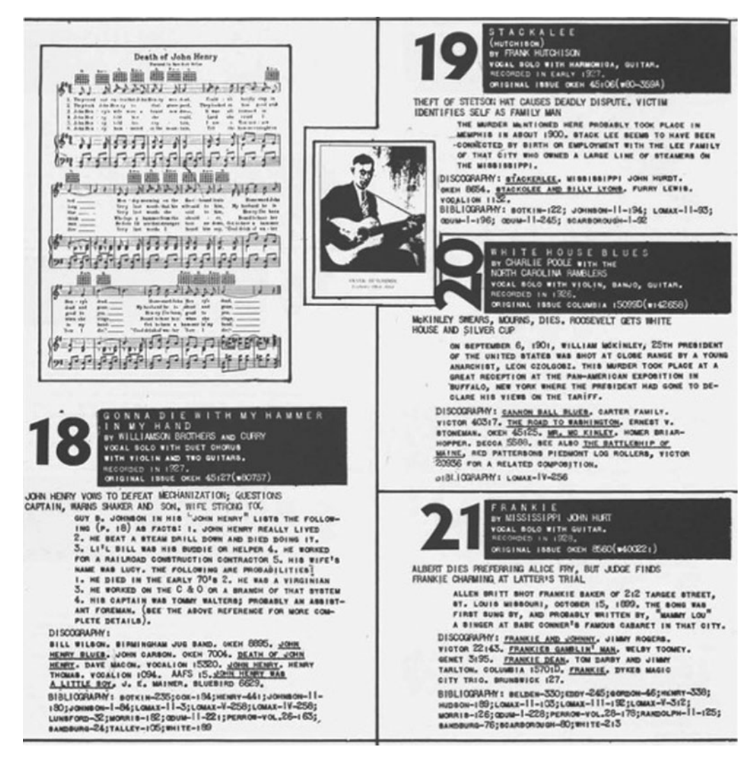
Figure 2. Example of Harry Smith's liner notes for Anthology of American Folk Music.

Unlike collectors of blues and jazz who were concerned with finding the best performances and most authentic renditions, Smith's criteria saw value in a number of tracks that might have otherwise been excluded.