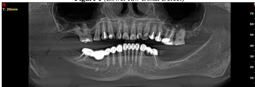
Figure 1 (Lower Jaw Distal Defect)

Progress in medicine is determined by whether we get the maximum result with minimal intervention. In some cases, the use of gum-level implants allows us to do just that, especially in cases of alveolar folds and soft tissue atrophy on the lower jaw, when it is impossible to achieve a stable result in time without additional surgical intervention. Influence of the size of the microcap on crestal bone changes around titanium implants. A histometric evolution of unloaded non-submerged implants in the canine mandibula; Joachim S, Hermann JS, John D, Schoolfield, Robert K, Schenk, Daniel Buser and David L Cochran. Journal of Periodontology . October 2001