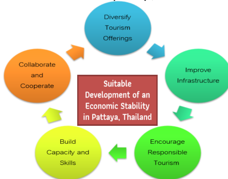
Figure 1 : Implementation the result of this research for suitable development of an economic stability in Pattaya, Thailand.

sustainable economic development that benefits both the local communities and the tourists while minimising negative impacts on the environment and culture.