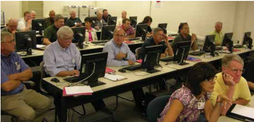
Operations Management faculty members from graduate residence centers in several states attend a conference on the UA campus for training and exchange of ideas and methods.

The Operations Management program is designed for the working student who typically holds a professional or management position in an organizational setting, whether business, military, non-profit, or governmental. Program content focuses squarely on the concepts, methods, and tools that are essential to the successful management of both work processes and people in a wide spectrum of organizations. The curriculum grows out of an Industrial Engineering perspective on management and equips graduates to carry out their managerial responsibilities more efficiently and effectively. The curriculum is presented both by Industrial Engineering faculty and by academically qualified