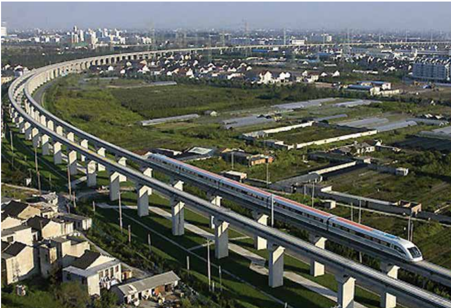
The 19-mile Chinese Maglev line serving Shanghai Airport has been fully operational since 2002.

Gue of Auburn University under the auspices of a Mack-Blackwell Rural Transportation Center research project.