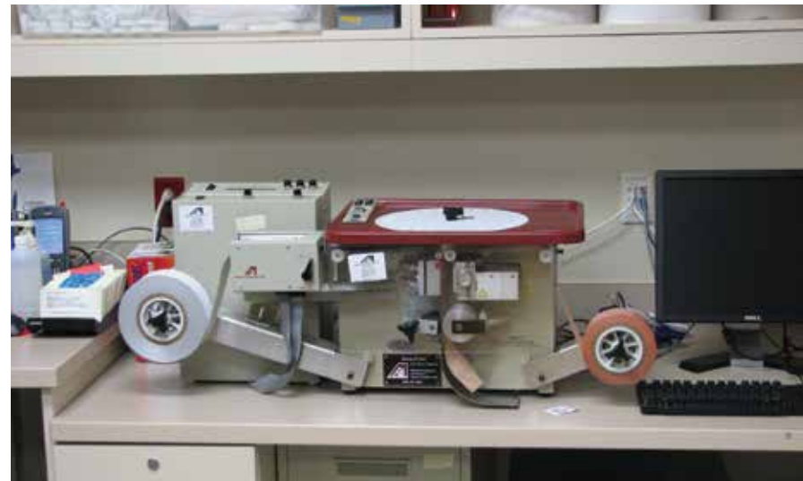
This small-scale medication repackaging device is used in single hospitals to create unit doses from bulk-packaged medicines for distribution to patients. It illustrates the “cottage industry,” human-operator-heavy feel prevalent in today’s healthcare delivery system. More automation and centralization can improve both the efficiency and accuracy of such processes.