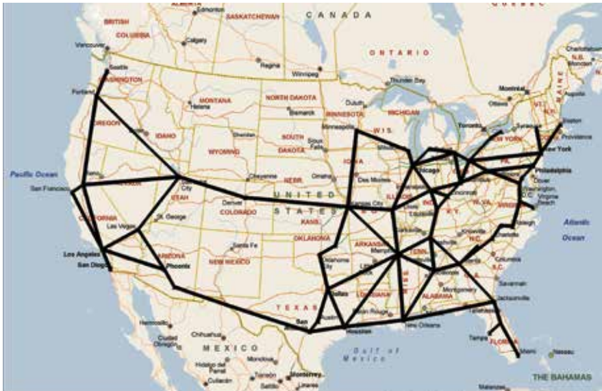
Model of a 20,000-mile nationwide high-speed rail network, developed by researchers Meller et al as part of a study on new approaches to relieving highway congestion and expediting freight distribution across the United States.