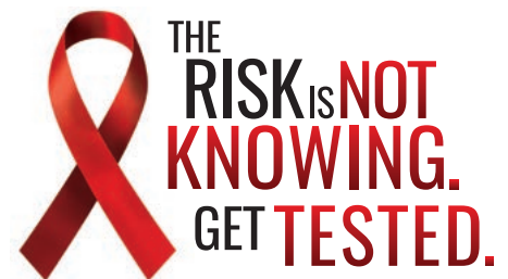
Figure 1: Pitt County AIDS Service Organization, Greenville, NC ( picaso.org/testing-program.html ).

or as frequently as necessitated depending on risk. Any contact with blood, semen, vaginal fluid, anal mucus, or breast milk presents an opportunity for HIV exposure and should trigger consideration for testing. Testing is highly recommended for pregnant women and routine for infants born to HIV-positive mothers. Testing and treatment together led to 1% risk for mother to child transmission, down from 35%. Tests are covered by insurance, Google is helpful for locating testing facilities by ZIP code, and HIV/AIDS advocacy websites offer plenty of advice on how to approach personal issues frequently associated with HIV testing and HIV status. Simply stated, one can contribute to stopping HIV by getting tested and encouraging people to do so. Over the years, testing has been refined tremendously, allowing for fast, reliable, and convenient processes. Most importantly, testing leads to HIV status awareness, which allows access to treatment.