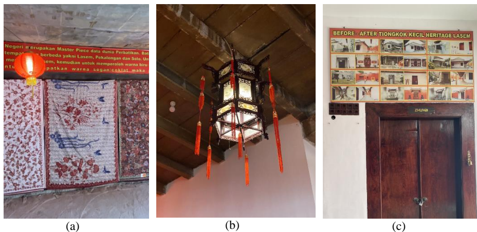
Figure 2 (a) Batik fabrics displayed across the wall; (b) distinct lampshade design; (c) poster of before-and-after the renovation of the house.

This house was built in the year 1860 and has now become a designated tourism destination, targeted mainly at visitors from outside Lasem, and has acquired awards and titles from tourism-related competitions or awards. Many of the achievements are exhibited on the outside of the house, along with pictures of rather famous or respectable visitors during their visit to this house. Like Rumah Oei, Rumah Merah also offers rooms for guests as a homestay, however, they also have facilities such as a large space to be used for meetings or events. To enter the main part of Rumah Merah, visitors are required to pay a fee of Rp5000 (around USD 0.3).