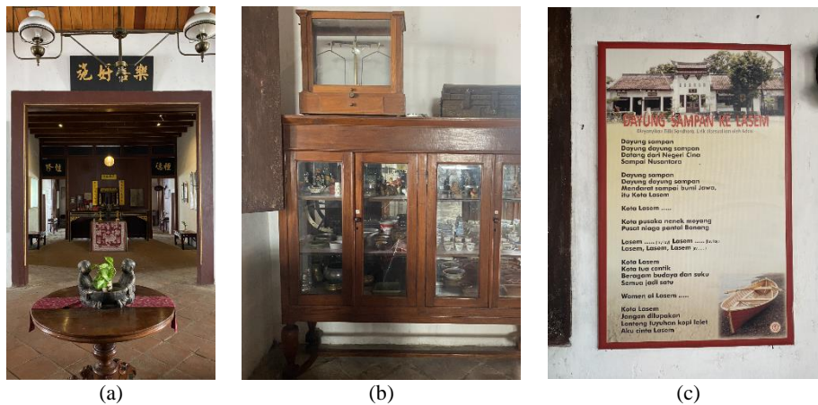
Figure 1 (a) View upon entering the main house of Rumah Oei; (b) one of the cabinets filled with collections; (c) a poster of ‘Dayung Sampan Ke Lasem’ song lyrics.

showing various items of antiques and collectibles ranging from ceramic tableware and figurines, vintage cassette tapes, and old typewriters, all neatly lined up inside the cabinets (see Figure 1). Another mundane or ‘daily’ object displayed in an eye-catching manner is an old kebaya encim (a type of woman’s clothes) that was put on a frame and hung on the wall, where other pieces of clothes presumed to also have been worn in the past, are displayed in a glass cabinet. There are also samples of batik fabric and old sewing machines on display. On the walls, visitors can see photographs of various sizes of the Oei family members from different generations. The rooms are set up in an orderly manner, welcoming visitors to take a look. The gallery area is decorated neatly, inviting visitors in. However, after the COVID-19 pandemic hit, the main door was left closed and will be opened only when visitors directly inquire with the staff. Even when the door is closed, the large windows facing the cafe area are open during the day, letting the customers take a peek at some of the display collections from the outside.