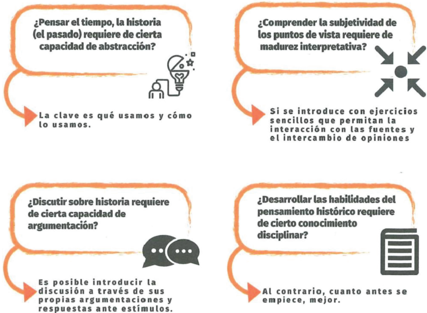
Figure 4. Difficulties learning history