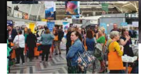
Delegates at the National Career Leaders Conference enjoying the exhibition.