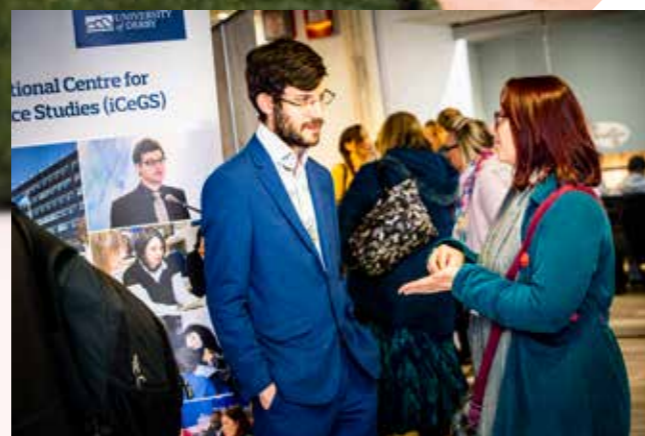
Annual Lecture 2019