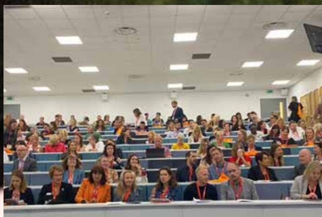
Career Leaders Conference 2023

I think it has inspired me to begin thinking about my own potential contributions to research.