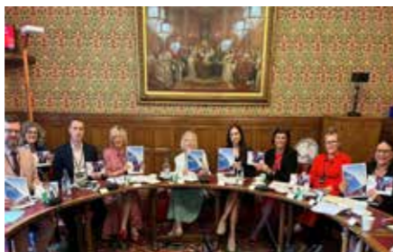
The launch of the Investing in Careers report at the House of Lords