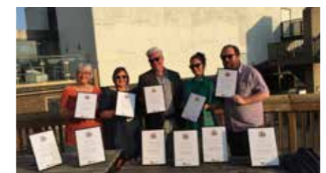
2018 - iCeGS wins the Vice-Chancellor's Award for Excellence for 'Outstanding Contribution to Research Excellence'.

iCeGS launches the MA in Careers Education and Coaching incorporating the Qualification in Career Development