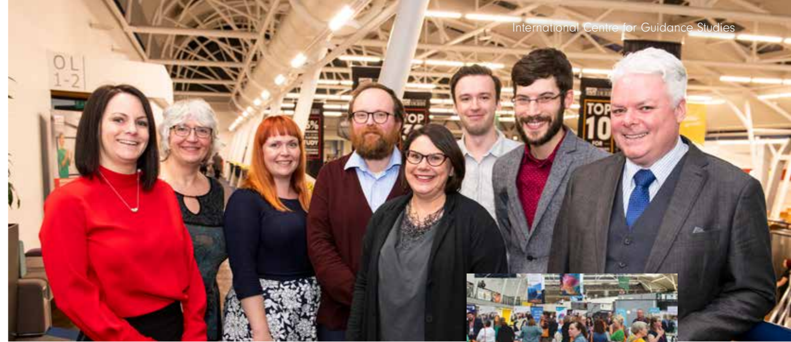
Team Photo 2018