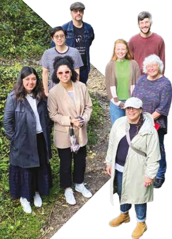
iCeGS staff at the Centre's annual away day in Whatstandwell, Derbyshire, September 2023.