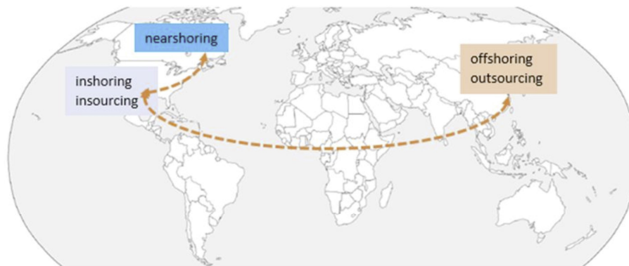
Figure 1. Display of offshoring, nearshoring and offshoring distance

In order to offer clients high-quality goods at competitive prices, two sets of activities and business processes work together. Throughout the many stages of