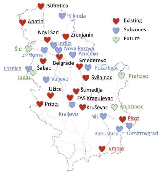
Figure 2. All free zones location in Serbia

Almost every nation in the world has a highly developed idea of free zones. It is crucial to note that while the idea of modern free zones is growing and receiving a lot of attention in the modern era, the fundamentals of free trade have been around for millennia and the first free zones are established at the free ports of Grecian and Roman times. The