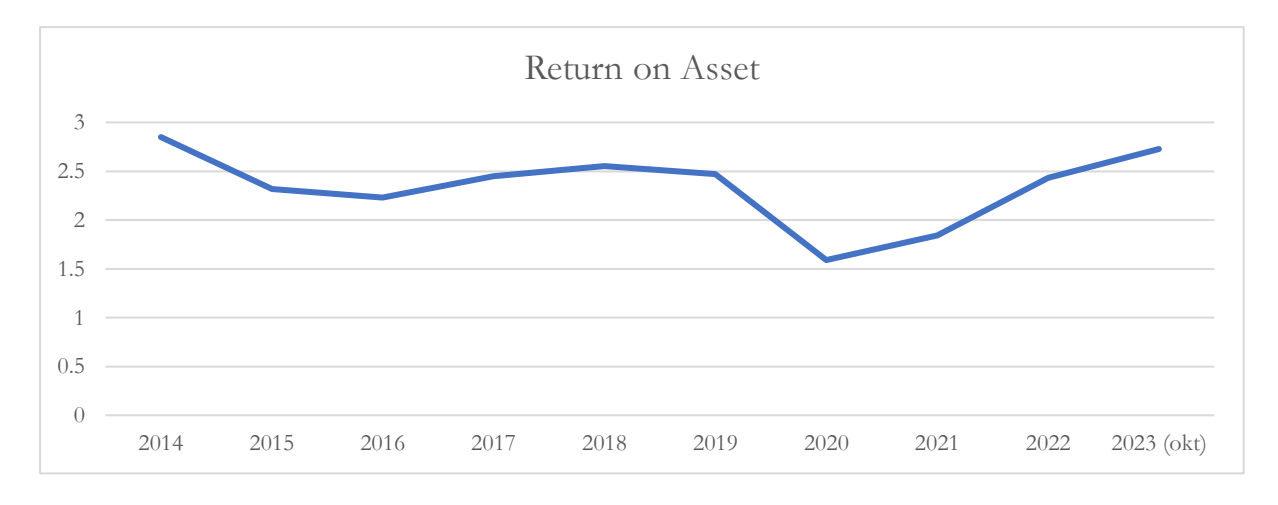
Figure 1. Return on Asset of Indonesian Banking

One of the sectors that drives economic growth is the financial services sector, including banking. Banking performance can be assessed from its level of profitability. There are several profitability indicators, including Return on Assets (ROA) and Return on Equity (ROE). However, because the size of an industry, including banking, is judged by how large its assets are, the profitability indicator chosen is ROA. Indonesian banking ROA experienced a decline as a result of Covid-19, but in the end Indonesian banking was able to recover, where ROA in 2023 was higher than ROA in 2015 to 2022.