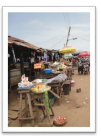
Figure 3 Dilapidated and abandoned shops; obstruction of traffic flow due to on-street trading; temporary sheds