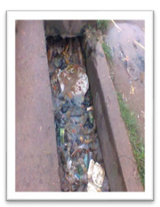
Figure 2 A heap of waste awaiting collection; non-functioning bore-hole; indiscriminate disposal of waste into the drainage system in Odo-Ogbe market

It was also observed that there was no provision for organized parking space in the traditional market to cater to the parking of vehicles of traders and other users. This deficiency encouraged on-street parking of vehicles. The situation was worsened by on-street trading that characterized the market, which had serious effects on traffic flow (See Figure 2). This made it extremely difficult for vehicles to access the roads for loading and off-loading of goods within the market. All these issues also accounted for the reason why "quality and reliability of services and facilities provided by government" as an indicator was required, and also importantly rated by the users.