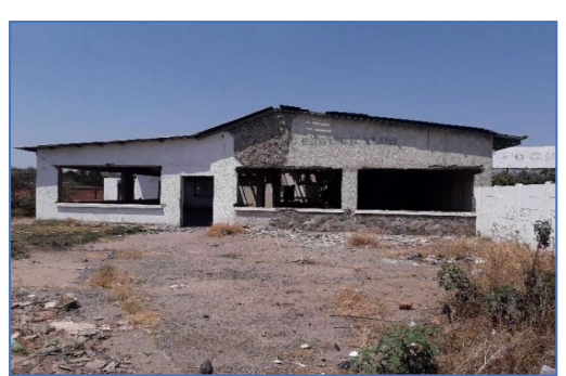
Figure 2 Selected photos of parts of Nkana Main Recreation Centre, Kitwe.