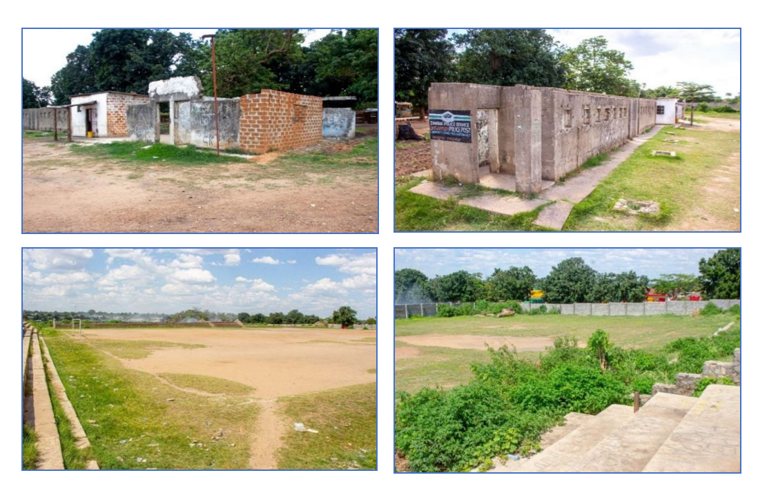
Figure 3 Chamboli Football Ground Club House/Police Post, change rooms, football pitch, and volleyball court.