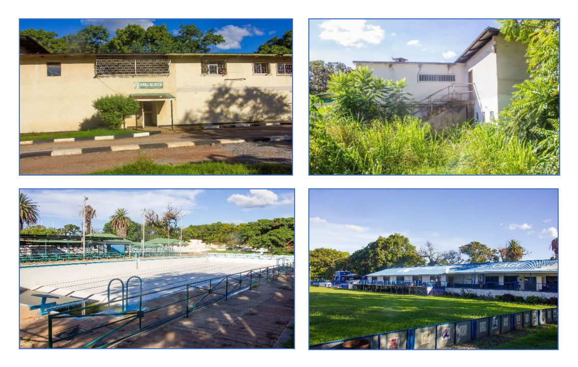
Figure 4 Selected photos of parts of Mufulira Main Recreation Centre.

The Mufulira Main Recreation Centre also has various club buildings according to sporting disciplines and therefore varying levels of deterioration as shown in the pictures below.