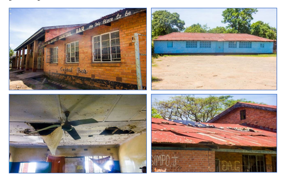
Figure 5 Aspects of the Bufuke Club House.

Bufuke Club House is located in Bufuke Township, a low-cost area of Mufulira Town. The Condition Assessment Report (Ngoma, 2021) revealed that the main buildings of Bufuke Club House are structurally stable; however, the roof requires major rehabilitation. The deterioration in the roof has caused the collapsing ceiling due to the leakages of moisture. The ablution block and change house are also structurally solid, but the roof and sanitary fittings need replacement. Bufuke Club House is therefore given a Rating of 3 - Marginal, meaning it meets minimum requirements but has significant deficiencies. Figure 4 shows Bufuke Club House entrance, camp house, collapsing ceiling and damaged roof.