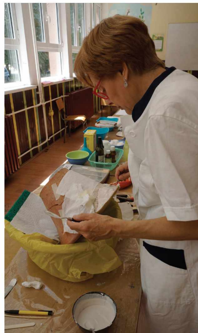
Fig. 5. Conservation of a pottery vessel

Inside Shelter 1, two spatial units are distinguished (Fig. 6): 1) central part – a basin with the re-