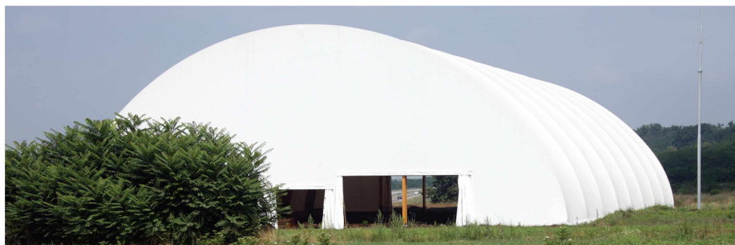
Fig. 3. Shelter 1, Drenovac, view from the south

in 2014. Various specialist from Center for Conservation (CIK) 14 , Faculty of Philosophy in Belgrade 15 and National academy of arts, Sofia, 16 worked on the best strategy for preservation and conservation of Neolithic houses. This included monitoring conditions of the environment and tests for the most effective procedures in order to propose the necessary conservation and restoration treatment. In 2016, The Center for Preventive conservation, from the Center for Conservation (CIK) introduced preventive conservation. 17 The goal was to perform an initial condition survey and the assessment of the environment. Preventive conservation has been implemented on site (inside the shelter), during excava-