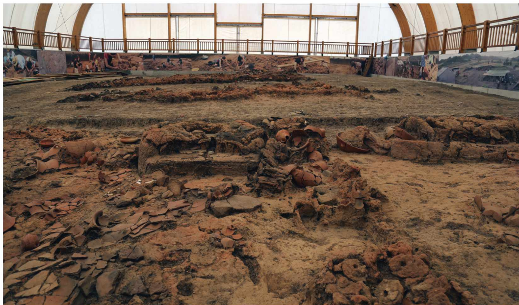
Fig. 6. Shelter 1, interior

mains of the houses - on excavation level, up to 2 m under the surface. This space is secured with retaining concrete wall and enclosed with a wooden fence; 2) open space, on the surface level, designed for communication, sighting and as an exhibition space.