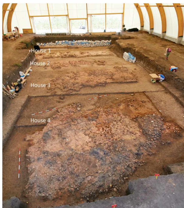
Fig. 7. Shelter 1 with position of the houses, photographed during excavations

Inside the basin, the remains of four 23 Late Neolithic houses are investigated and preserved for in situ presentation (Fig. 7). The idea was to present the part of the settlement – „a neighborhood” – as houses differ in preservation so each has a different feature visible and a story to tell. With the exhibiting a part of the densely packed settlement, where neighboring houses had to communicate and share immediate open spaces, we also aim to visualize communal life in the settlement.