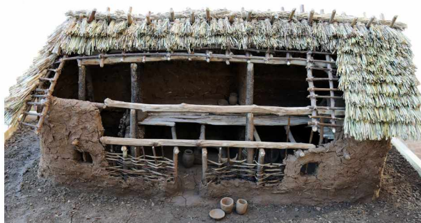
Fig. 9. Model of the Late Neolithic house

archaeologists and architects - the entrance to the house, communication with upper storey, the appearance of the roof. This ideal model was made to „revive“ the house, to visualize destroyed elements of architecture to visitors and to bring them closer to the appearance of the houses (and settlement) back to 5000 BC. Having both the model and original in situ remains creates a better balance between what is known for sure and what is conjecture - between real and reimagined, stating the visitors clear what are the limits and process of archaeological interpretation. This approach can perhaps evoke more respect for the past and knowledge about the past, that sometimes contains more mysteries than answers.