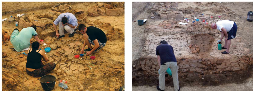
Fig. 4. Process of cleaning (4a) and conservation (4b) of House 1, Drenovac

a large quantity of daub was preserved. This kind of material needed specific treatment, usually by different inorganic consolidants (Fig. 4b). 21 The important issue that had to be taken into account was to preserve the original colour and texture.