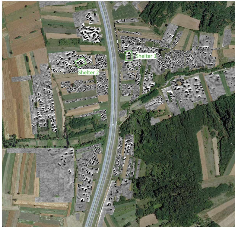
Fig. 2. Drenovac – geophysical plot