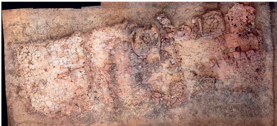
Fig. 8. House 1, orthophoto (source: Documentation of the Institute of Archaeology, Belgrade)

One house stands out for its remarkable preservation (House 1), thanks to the thick layer of colluvium that „sealed“ the remains soon after the dwelling was abandoned and burnt (Fig. 8). This house was a two-storey building with three separate rooms in the ground floor measuring 12 by 5 m in total. Two horseshoe-shaped ovens were found in situ on the ground-floor, while the remains of a third oven felt from the upper storey. This particular house provided an insight into common daily activities of the household residents: food-preparation activities are connected to the ovens and large number of different types of vessels and grindstones. Two locations with loom weights – one in western and one in the central room, are clear indications of space allocated for weaving. Four small clay tables were part of the house inventory, but their function and use is not clear. One of them was found along with the weights, which may indicate a certain connection between these artefacts within a specific activity. 25