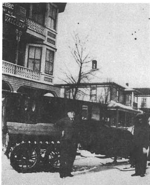
EARLY VERSIONS: Left-- the motoneige of the Val- court Hotel in 1927; below-- a 1935 model.