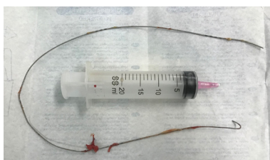
Figure 2. The 70 cm long guide wire was removed.