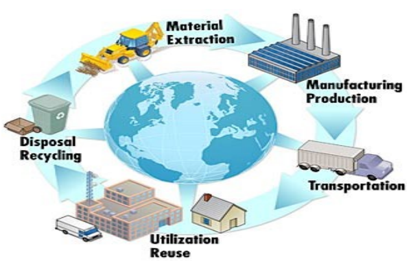
Figure 4: LCA for Geo-technical Engineering Projects.