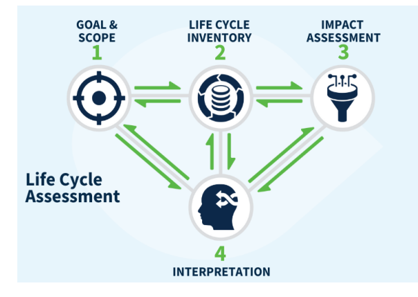
Figure 1: LCA Framework.