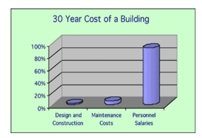
Figure 3: LCA for building construction.