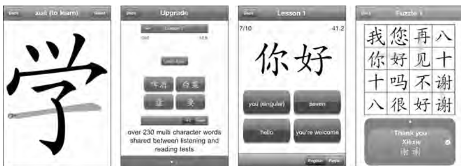
Figure 14.1 Screen Shots for Writing, Listening and Reading Sections and the Word Search Section

Learners can set the level that suits them (easy, normal or hard). The default is Easy with stroke order indicator and 60 seconds per test. If users choose a harder level, the time available shortens and the stroke order indicator disappears. As users complete each character, data is kept within the device memory to allow the users to see how many times they have practised it.