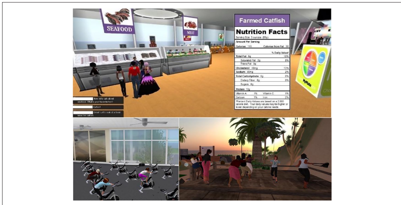
Figure 3. (Upper) Education sessions on physical activity and healthy eating with diabetes. 23 (Lower left) Virtual exercise facilities for indoor cycling and (Lower right) beach dancing stage for virtual reality diabetes exercise training, 24 reproduced with permission of CC-BY license.

found that self-management education for T2D can be delivered using virtual exercise facilities and food exhibits. The VR system was used to deliver the evidence-based behavior-change curriculum, which seeks to enhance diabetes knowledge. It also aims to optimize attitudes toward diabetes self-management, develop behavioral self-management skills including glucose tracking and goal setting, facilitate changes in dietary intake, physical activity, blood glucose self-monitoring, and medication adherence. 24 The VR diabetes education was compared to in-person format, 24 finding that physical activity increased by 18% in the virtual group, whereas it decreased by 25% in the face-to-face group.