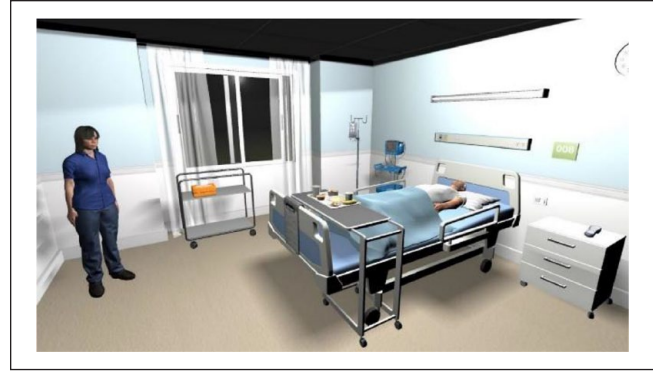
Figure 1. Virtual clinical training was found superior to normative training when used for education of second-year nursing students ( n = 171 ), 18 reproduced with permission of CC-BY license.

Within education and training for diabetes, there are various circumstances in which difficulties emerge where VR can be of help. Virtual reality can help with training health workers in rural areas, where there is often a lack of diabetes experts and the prevalence of diabetes can be almost twice the national average, such as in Appalachian Ohio. 17