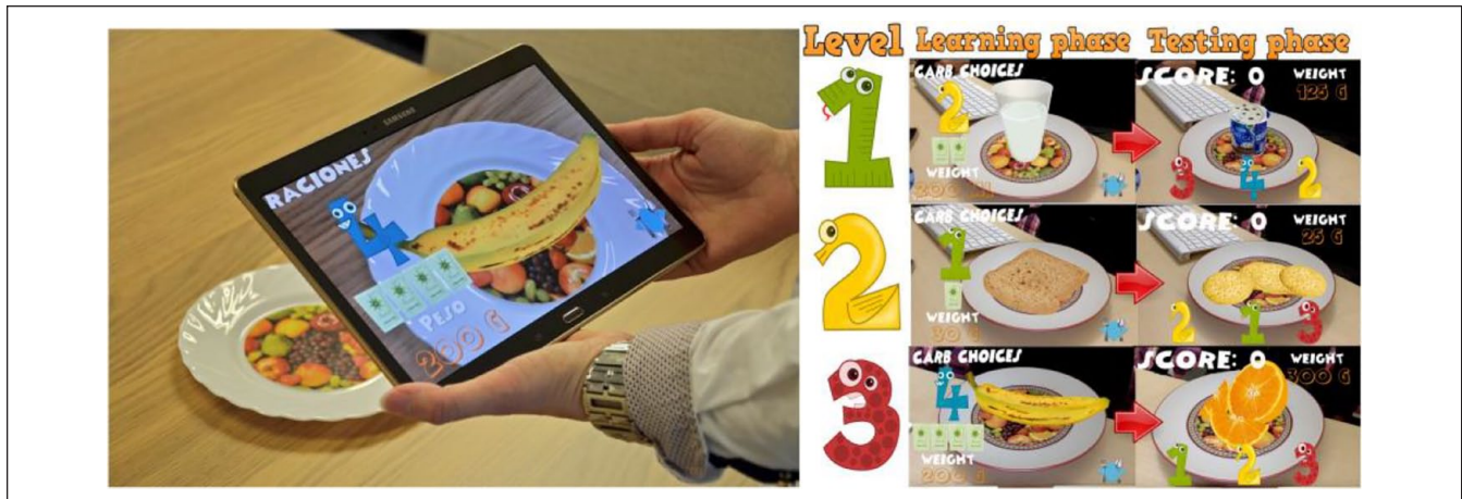
Figure 4. Augmented reality carbohydrate training for children with diabetes, 29 reproduced with permission of CC-BY license.