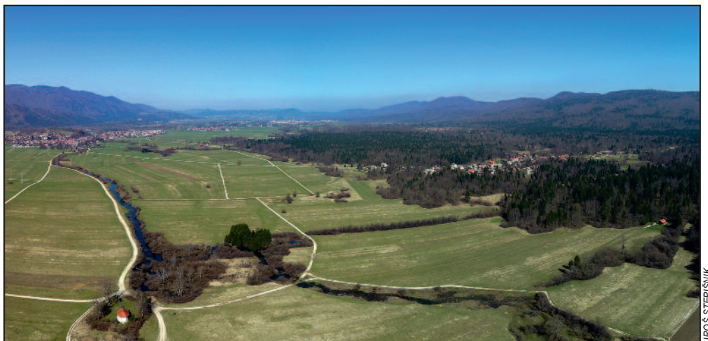
Figure 5: The Ribnica-Kočevje Plain is the largest marginal plain of fluvio karst in Slovenia and is the remnant of a former inflow type of polje, once the largest polje in Slovenia.

parts with a slight slope. The relict parts of the poljes become flat rocky plains with patches of sediment cover, and are characterized by a high density of dolines. Although this flattening is often attributed to tectonic activity (Gams, Kunaver and Radinja 1973; Gams 1974), it is actually due to a reduction in the supply of fluvial clastic sediments to the polje floors (Stepišnik 2021a; 2021b).