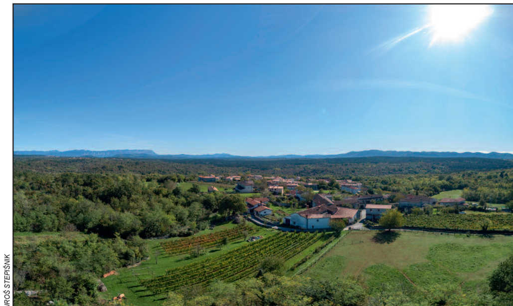
Figure 2: The largest karst plain in Slovenia is the Karst Plain.

There are two karst plains that offer a distinct set of geological and geomorphological features. The Podgorje Plain (slv. Podgorski ravniki ) is a more complex karst plain, characterized by its alternating layers of limestone and flysch. It is partially dissected by the Grižnik Canyon, which merges into the Glinščica Canyon across the border in Italy. The canyon was formed through antecedent incision but was eventually stopped due to the bifurcation of water into the karst, resulting in a ponor-type of contact karst (Gams 2004). The Banjšice-Trnovo Plain (slv. Banjško-trnovski ravniki ) is also a unique karst plain. The former