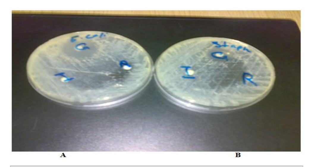
Figure (3):Antibacterial activity of extracted glycoside against two clinical isolates ( A- E. coli B- S. aureus )