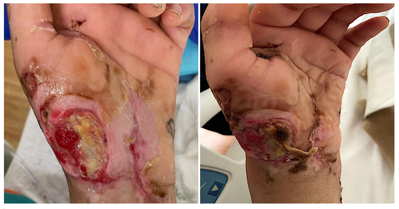
Figure 1. Krokodil-induced cutaneous ulceration is evident in the form of a stage III ulcer on the right hand, characterised by an irregular margin. This ulcer is accompanied by signs of infection, including purulent discharge. Additionally, there is the presence of granulation tissue and desquamation in the surrounding area of the ulcer.

The solution injected, comprising petrol and hydrochloric acid, results in discoloured scaling and ulceration<sup>[8,9]</sup>. Concurrently, iodine inflicts notable harm on muscles