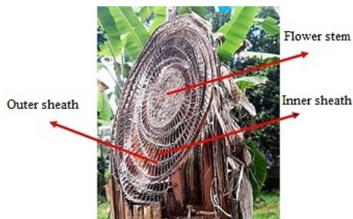
Fig. 1. Image of the wall structure of the pseudostem of Musa acuminata .

The pseudostem of the banana plant is also known in the country under the names of guasca, calceta or yagua. This pseudostem has a high moisture content and is formed by a group of leaf sheaths that seem to form a roll, as shown in Fig. 1. As the moisture content in the leaf sheaths decreases, they acquire resistance. Consequently, they have been used in the artisan fabrication of threads, ropes and load-bearing elements [14].