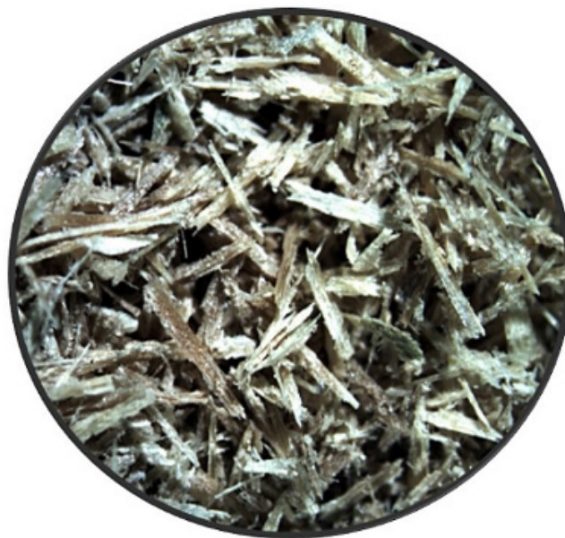
Fig. 2. Stereoscopic Image (30X) of Musa acuminata US standard mesh No. 40 pseudostem particles.

Stage 2: The dry cuts are subjected to grinding in a knife grinding machine to reduce the material to average size of 450 \mu\text{m} (US standard mesh No. 40). Guadua particles images were obtained using the NIKON SMZ800 stereoscope equipment [34] (Fig. 2). The ground material was screened on a W.S Tyler RO-TAP rotary screen using 450 \mu\text{m} screen. Moisture measurements were made on the ground material using the Mettler Toledo HB 43 moisture balance. It was emphasized that the humidity percentage was between 3% and 13%, according to ASTM D6007 [26] and UNE-EN 120 standards [27].