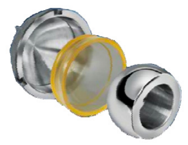
Figure 3) Configuration of PCU acetabular buffer [68]

The cushions are proved to function well in improving the lubrication condition and lower the local stress concentration so as to reduce the wear rate during the normal walk. However, for 95 percent of the time, people are not walking but standing still or moving slowly. Under such conditions, soft layer joint replacements must be designed to operate with thick elastohydrodynamic fluid films to provide some degree of protection as tribological conditions become severe, or alternatively incorporate alternative boundary or mixed lubrication mechanisms [54]. Furthermore, current cushion design only considered the elastic property of the layer to promote the lubrication condition by local deformation, which is not sufficient to approach the actual function of articular cartilage as the cushion cannot act exactly as the live soft bones. Besides deboning and high interface shear stresses, there is still great concern about the high level of friction and potential wear of soft layered bearings when they enter the mixed and boundary lubrication regimes. The high friction torque is also transmitted to the implantbone interface and may lead to joint loosening.