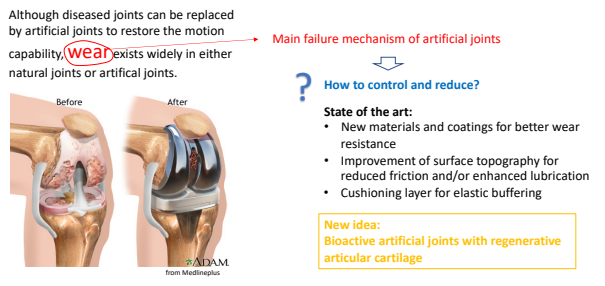
Figure 1) Illustration of main approaches to reduce the wear of artificial joints.

This mini review briefly highlights some representative works on developing the new types of artificial joints, especially on the micropatterned and elastic buffering artificial joints, and proposes a new possibility on developing the regenerative cartilage artificial joints, as (Figure 1) shows.