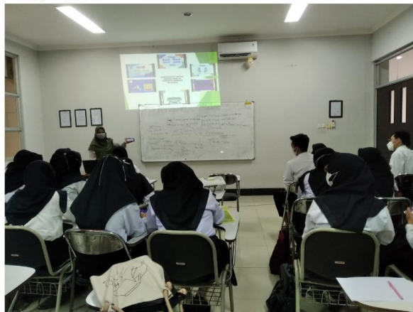
Figure 2. Researcher Demonstrating the Virtual Laboratory

The research aimed to explore the utilization of virtual laboratories in improving students' mastery of science concepts and critical thinking abilities.