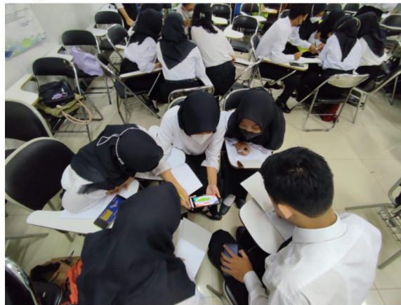
Figure 3. Access to the Virtual Laboratory: Group Discussion

Based on Figure 3, students access the Multimedia Interactive Weblog Science Virtual Laboratory application through group discussion activities that facilitate critical thinking and concept mastery. Thinking critically is essential for students to analyze problems and seek solutions related to the human circulatory system, mainly blood grouping. Moreover, using this application in group discussions can facilitate students' understanding of the basic concepts of blood types.