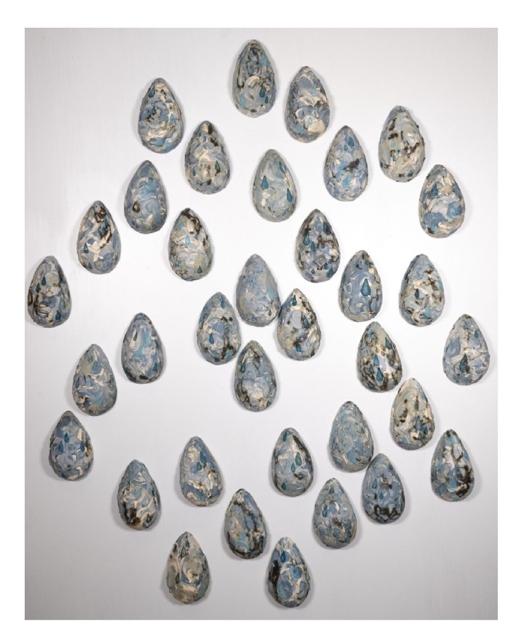
Some Days Are Worse Than Others 2023 half and half clay, colored slip, underglaze, high-fire stain 6" x 4" x 2" each