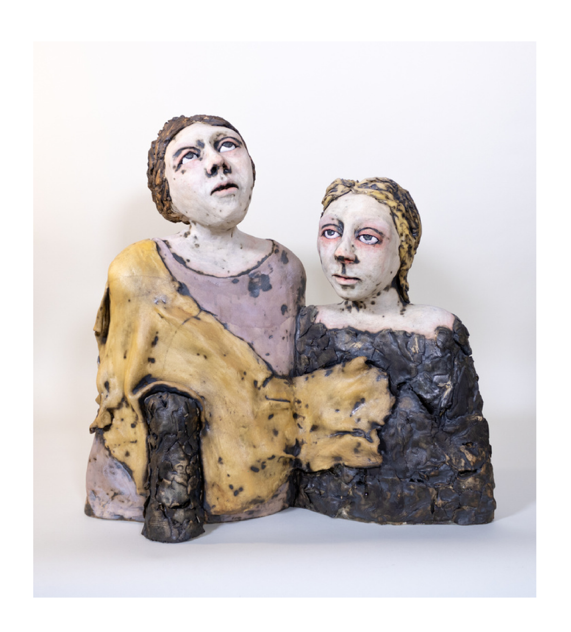
Sister \\ 2021 \\ half and half clay, underglaze, high-fire stain \\ 22"~x~21"~x~10"