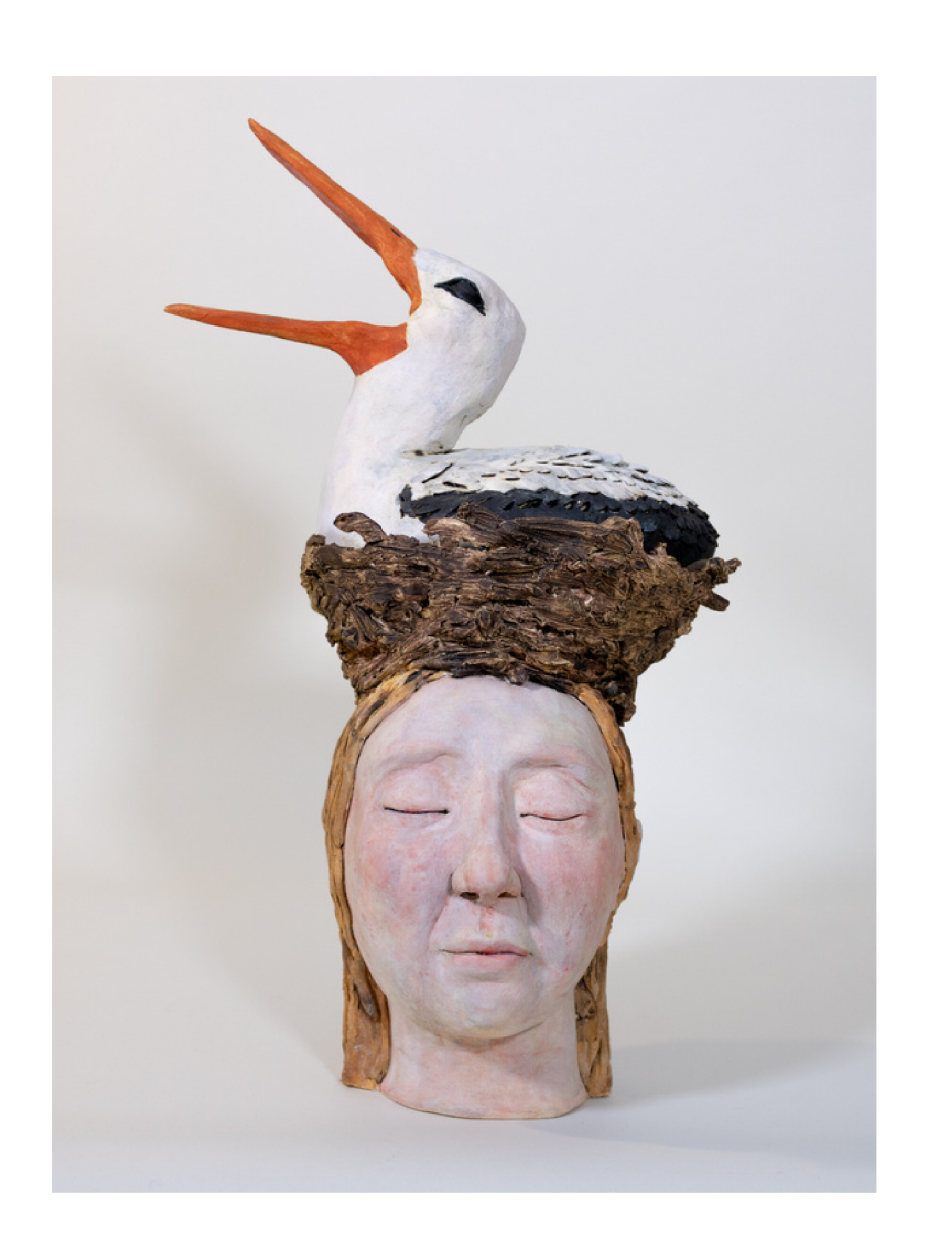
Silent Teachings 2023 ceramics, underglaze, high-fire stain 20" x 13" x 9"