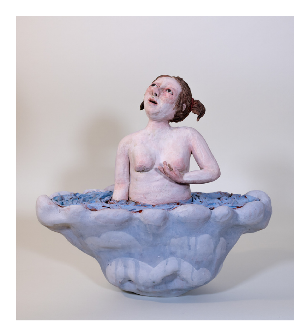
Wading In Waist-High Water (2) 2022 terra cotta, underglaze, low-fire stain 19" x 18" x 9"