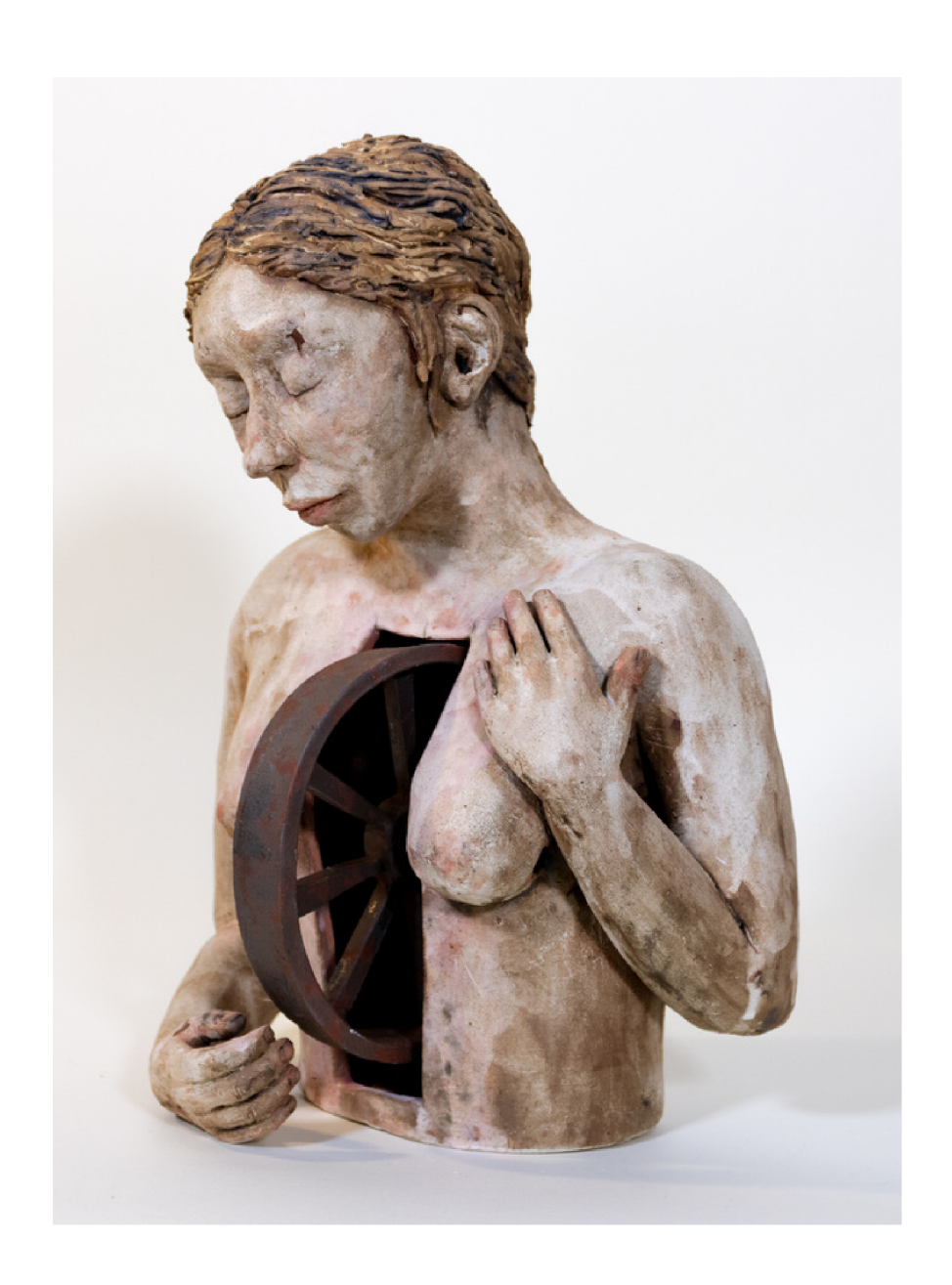
Rewind 2023 cone 6 red clay, underglaze, high-fire stain 14" x 10" x 9"