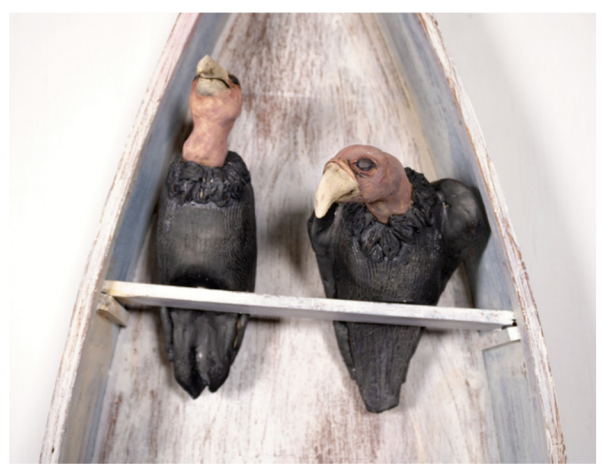
When Will Be The Right Moment? 2022 half and half clay, underglaze, high-fire stain 41" x 13" x 8"