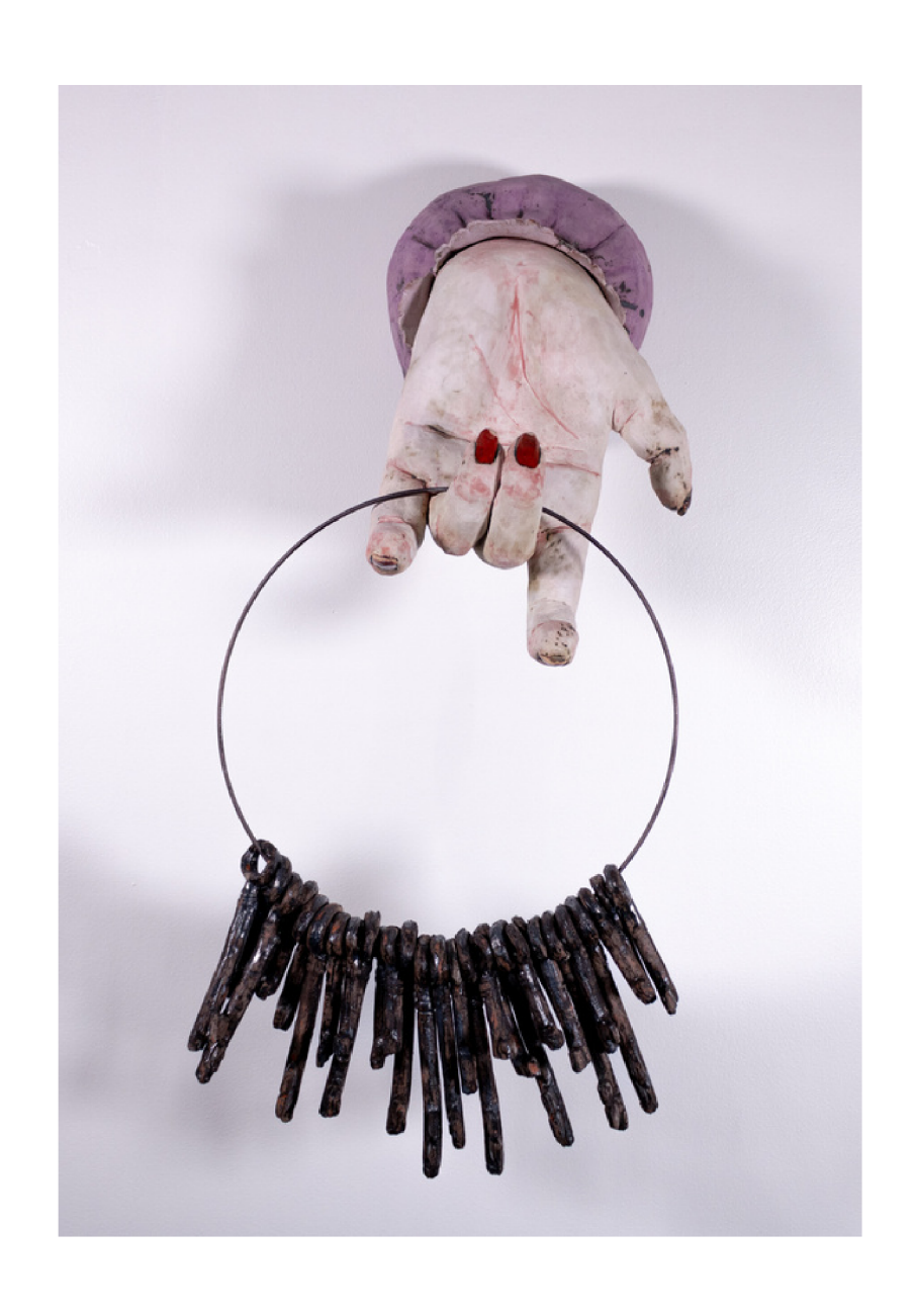
Old Keys Won't Open New Doors 2022 terra cotta, underglaze, low-fire stain 25" x 12" x 6" \,