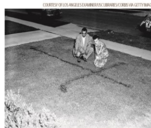
Rayfield Lundy, Republican candidate for the California 55th Assembly District inspects a bunif cross at 1816 East 122nd Street, Los Angeles, California. (1952)

For example, in 1867 Black turnout in Virginia was 90 percent. 70 After Virginia's voter suppression laws took effect, the number of Black voters dropped from 147,000 to 21,000. 71 During Reconstruction, 16 Black men held seats in Congress. 72 From 1901 until the 1970s, not a single African American served in Congress. 73