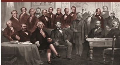
The first twenty-one Presidents seated together in the White House. The enslavers are shaded in red.