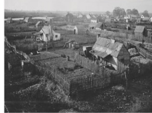
“Hampton, Virginia: ‘Stalwart’ After the Civil War, African Americans lived in large, segregated refugee camps like Stalwart because there was nowhere else for them to go. Hospitals, dispensaries, and military camps were unable to serve the masses of enslaved people, Black soldiers, and other refugees who entered the North due to the Civil War. Escaped and abandoned formerly enslaved people settled near or within the Union Army’s military camps and battle lines. The camps did not have adequate sanitation, nutrition, or medical care. One out of every four African American who lived in the camps died. (1864)”

In 1852, California passed and enforced a fugitive slave law that was harsher than the federal fugitive slave law, and this made California a more proslavery state than most other free states. 53 California also outlawed non-white people from testifying in any court case involving white people. 54