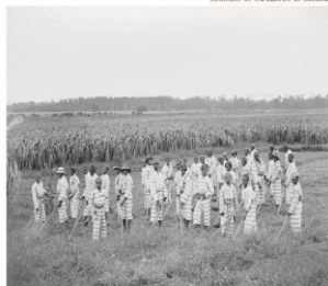
The convict leasing system in the South re-enslaved thousands of Black men and boys by arresting and convicting them of trumped-up charges. (1903)

The American criminal justice system overall physically harms, imprisons, and kills African Americans more than any other racial group relative to their percentage of the population. 202 While constitutional amendments 203 and federal civil rights laws 204 have tried to remedy these