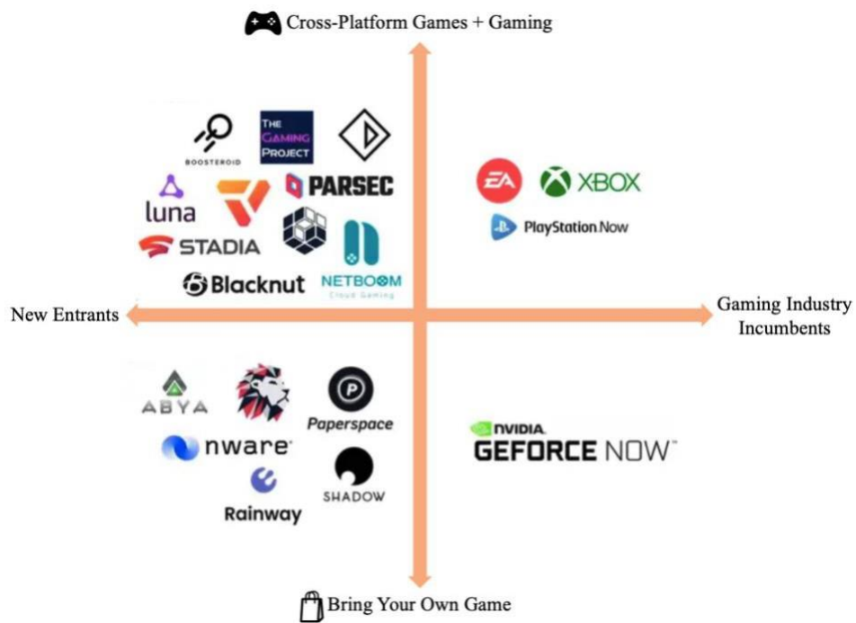
Graphic 1. B2C Cloud Gaming Landscape. (Table by author, Adapted from Rittik, "Cloud Gaming: rethinking the Value Chain")