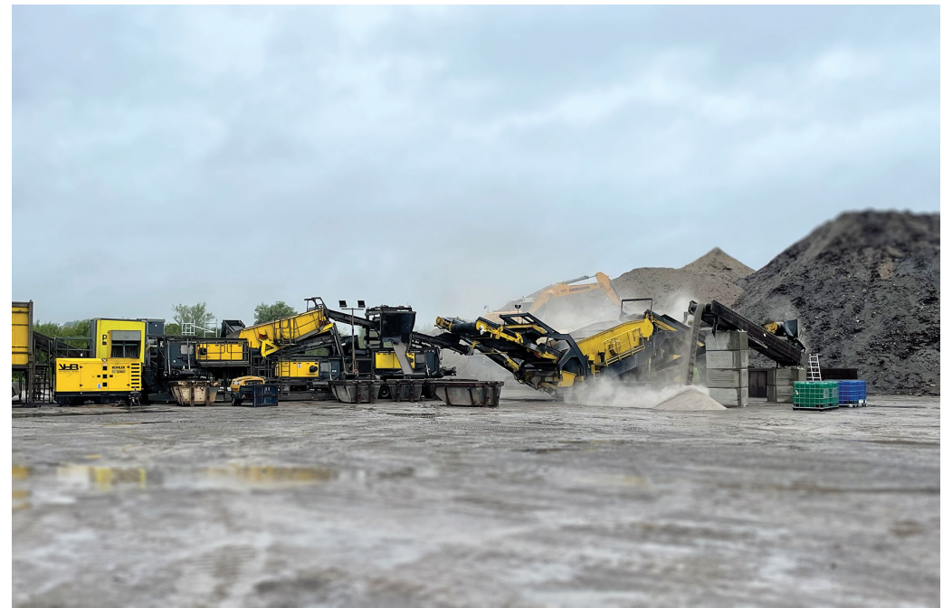
Fig 2 - CTU Dundee Uni.jpg