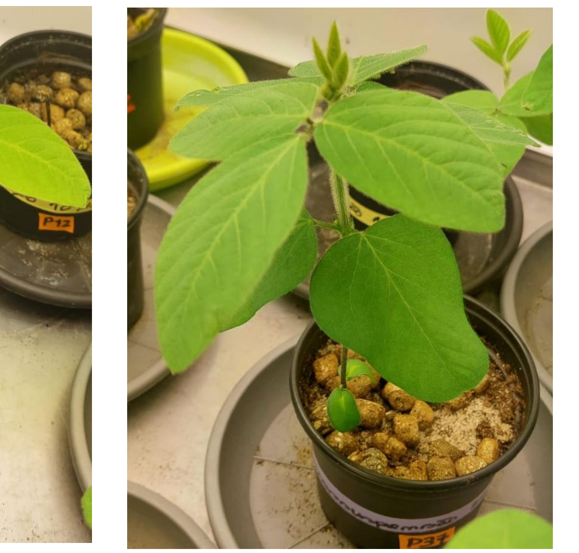
Figure 3- Healthy soybean leaves.